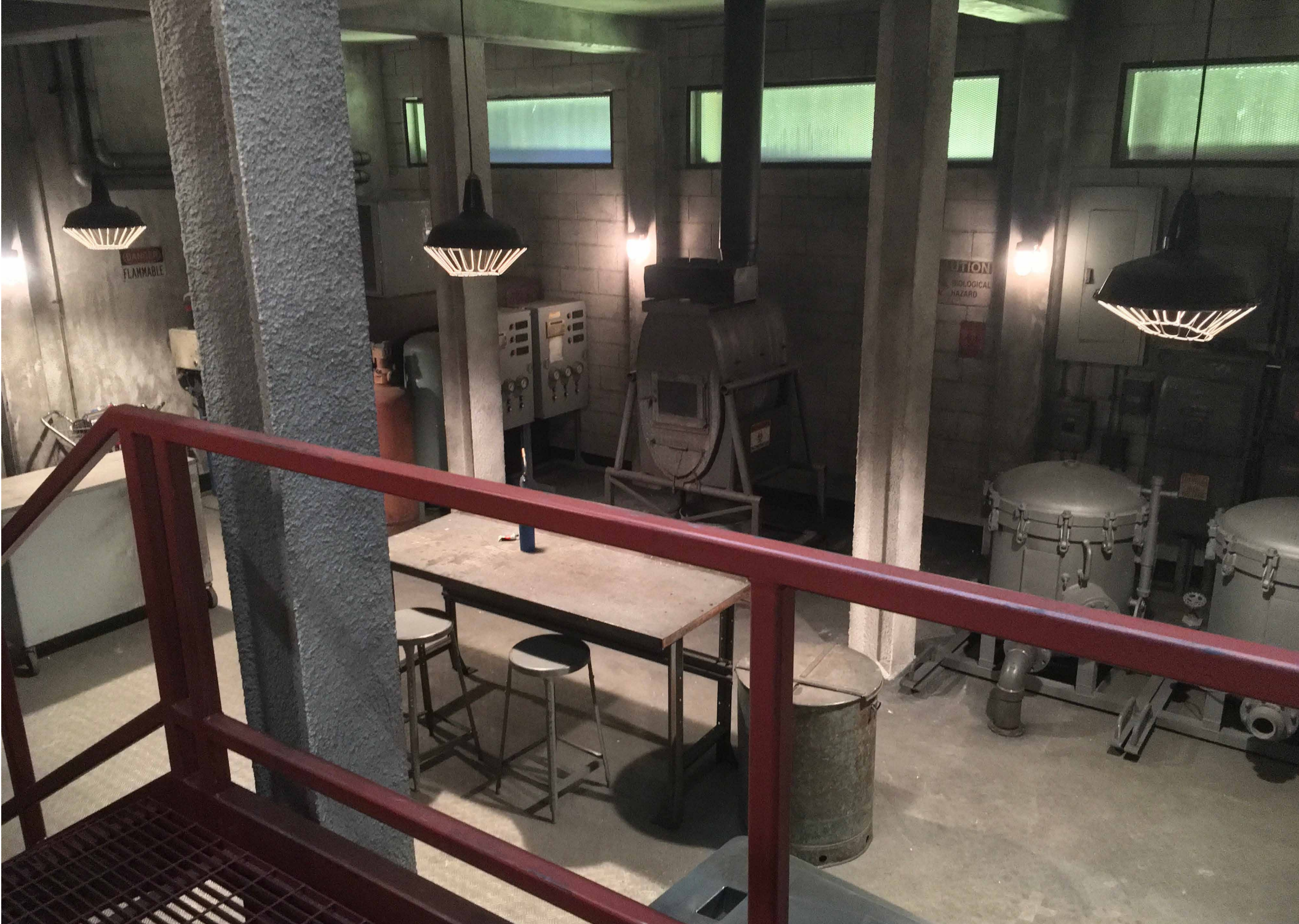
INT. KRONISH LABS - BASEMENT INCINERATOR ROOM [SONY STAGE 27] YEAR: 2017