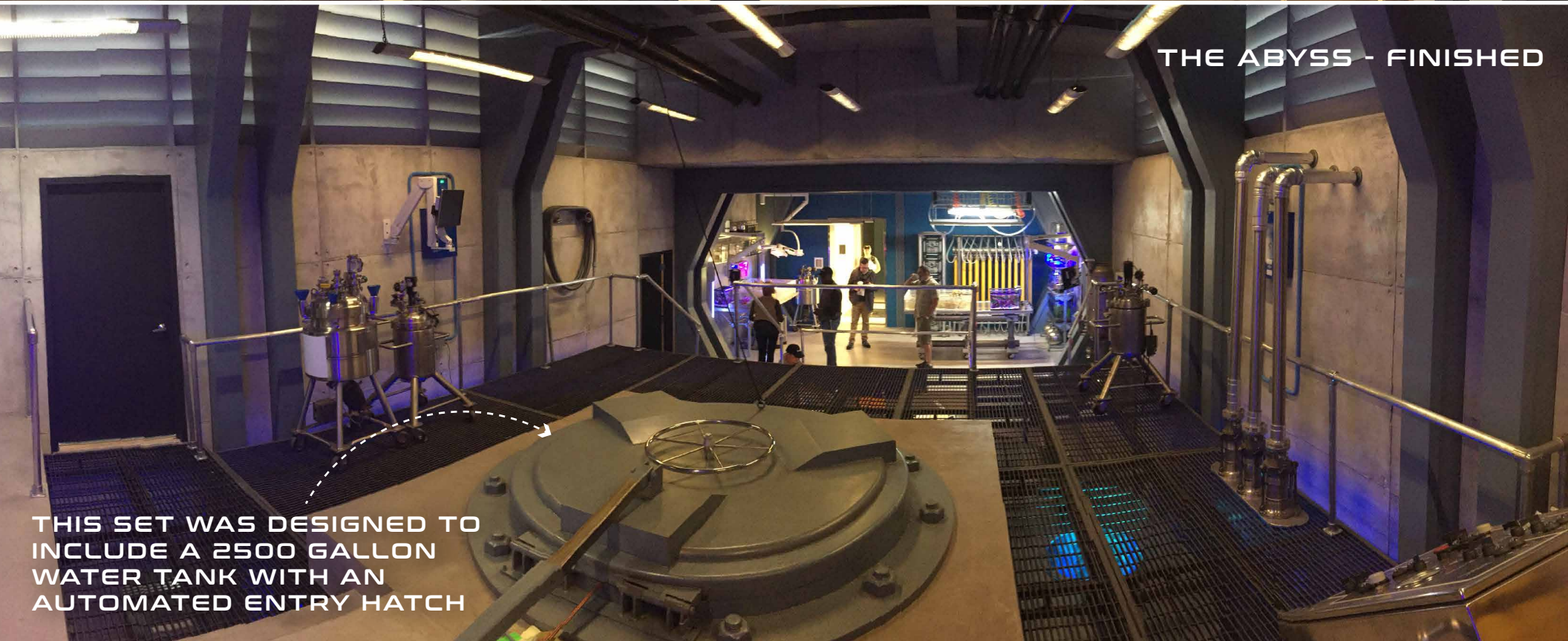
THE ABYSS - FINISHED

THIS SET WAS DESIGNED TO INCLUDE A 2500 GALLON WATER TANK WITH AN AUTOMATED ENTRY HATCH