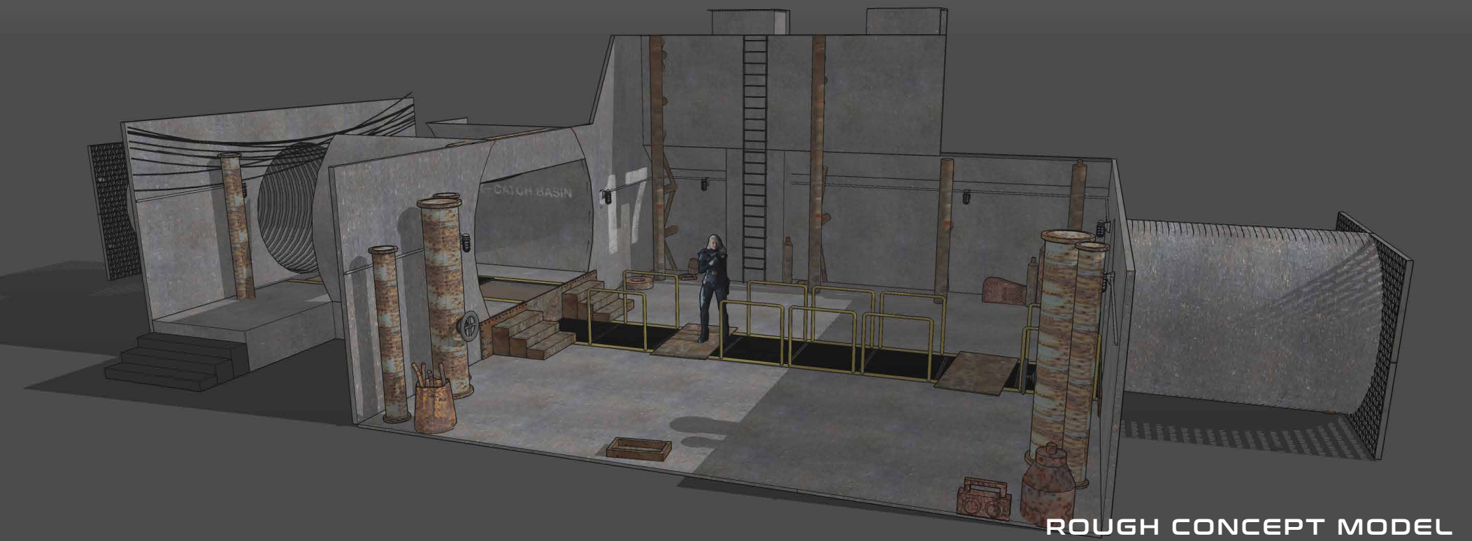
ROUGH CONCEPT MODEL