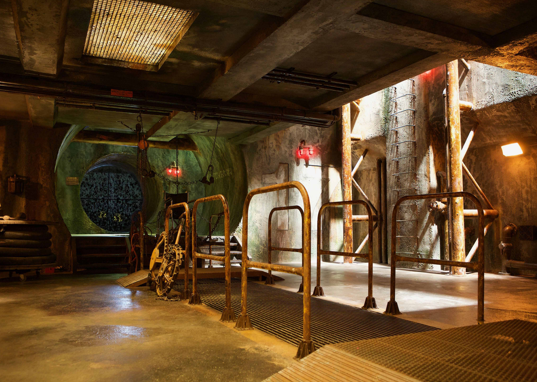
INT. SEWER [SONY STAGE 27] YEAR: 2017