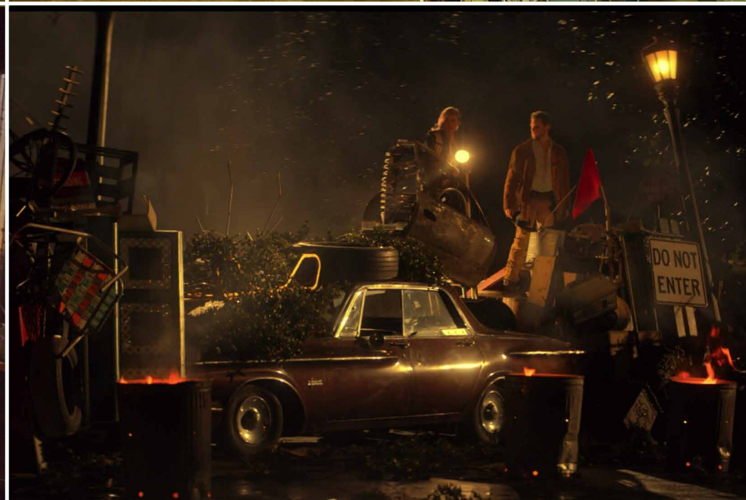
YEAR: 1969 - VARIOUS LOCATIONS / TOP: INT. SERVICE STATION BOTTOM LEFT: INT. FRAT MOON LANDING PARTY / BOTTOM RIGHT: EXT. BARRICADE