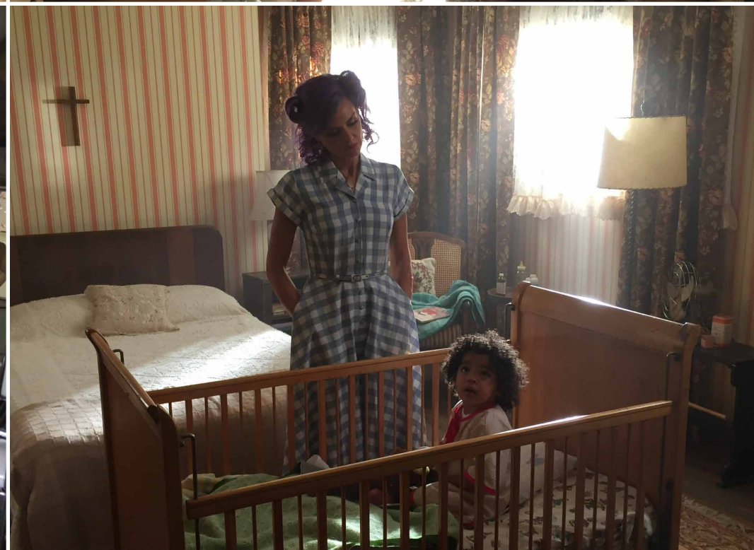
INT. MAMA KRONISH'S HOUSE [LOCATION & SONY STAGE 27] YEAR: 1949