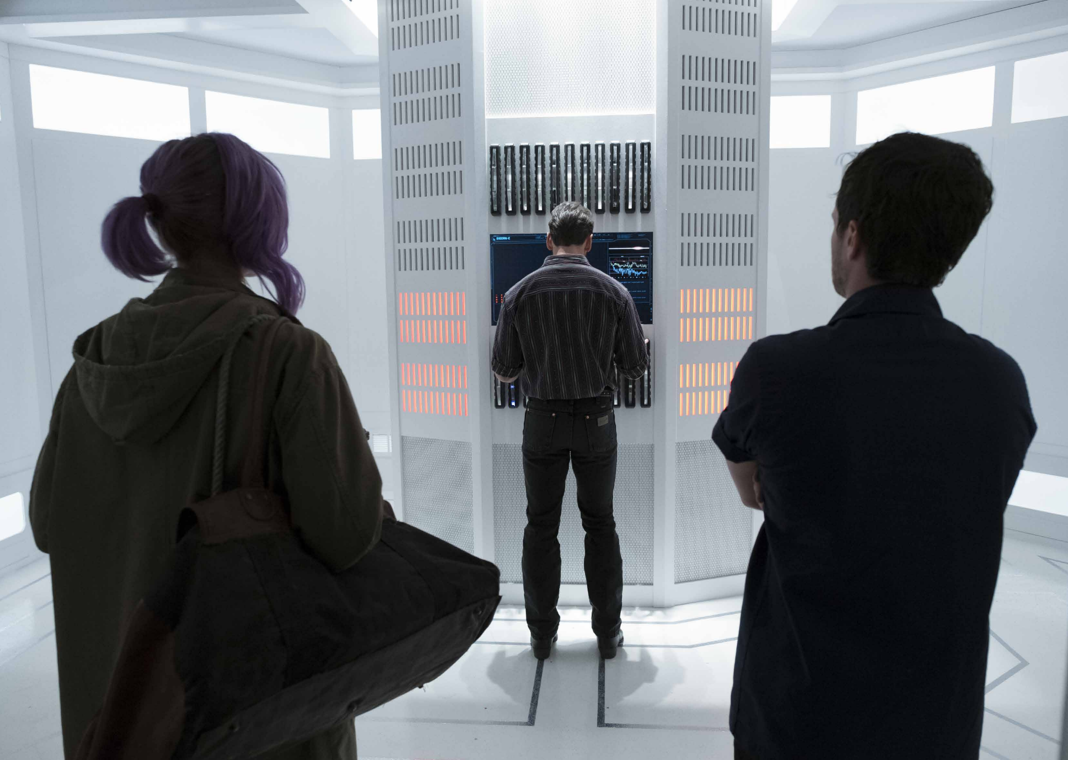
INT. JAMES CAMERON'S HOUSE - SIGORN-E CONTROL ROOM [SONY STAGE 27] YEAR: 2023