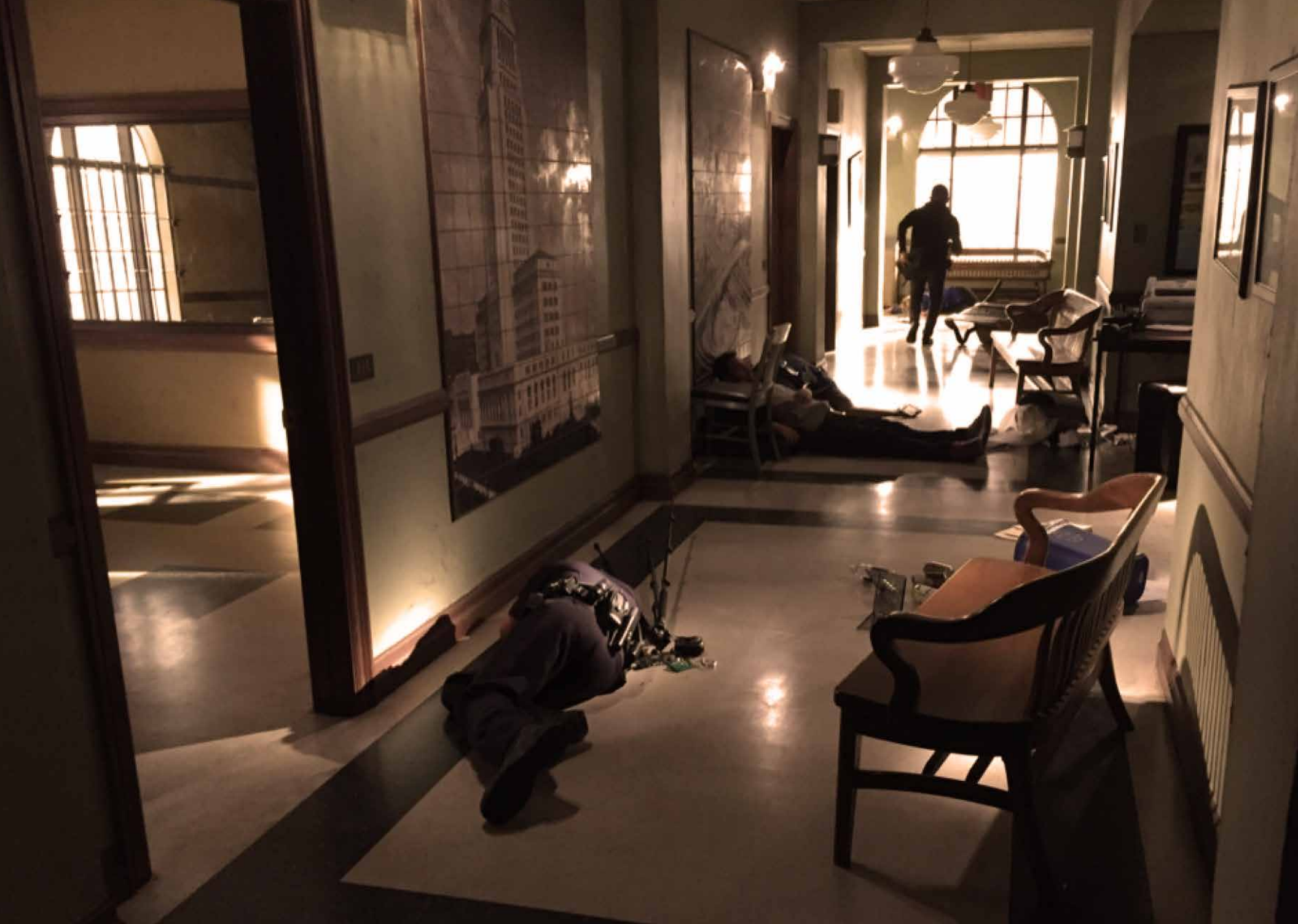
INT. LOS ANGELES POLICE DEPT. [SONY STAGE 27] YEAR: 2017