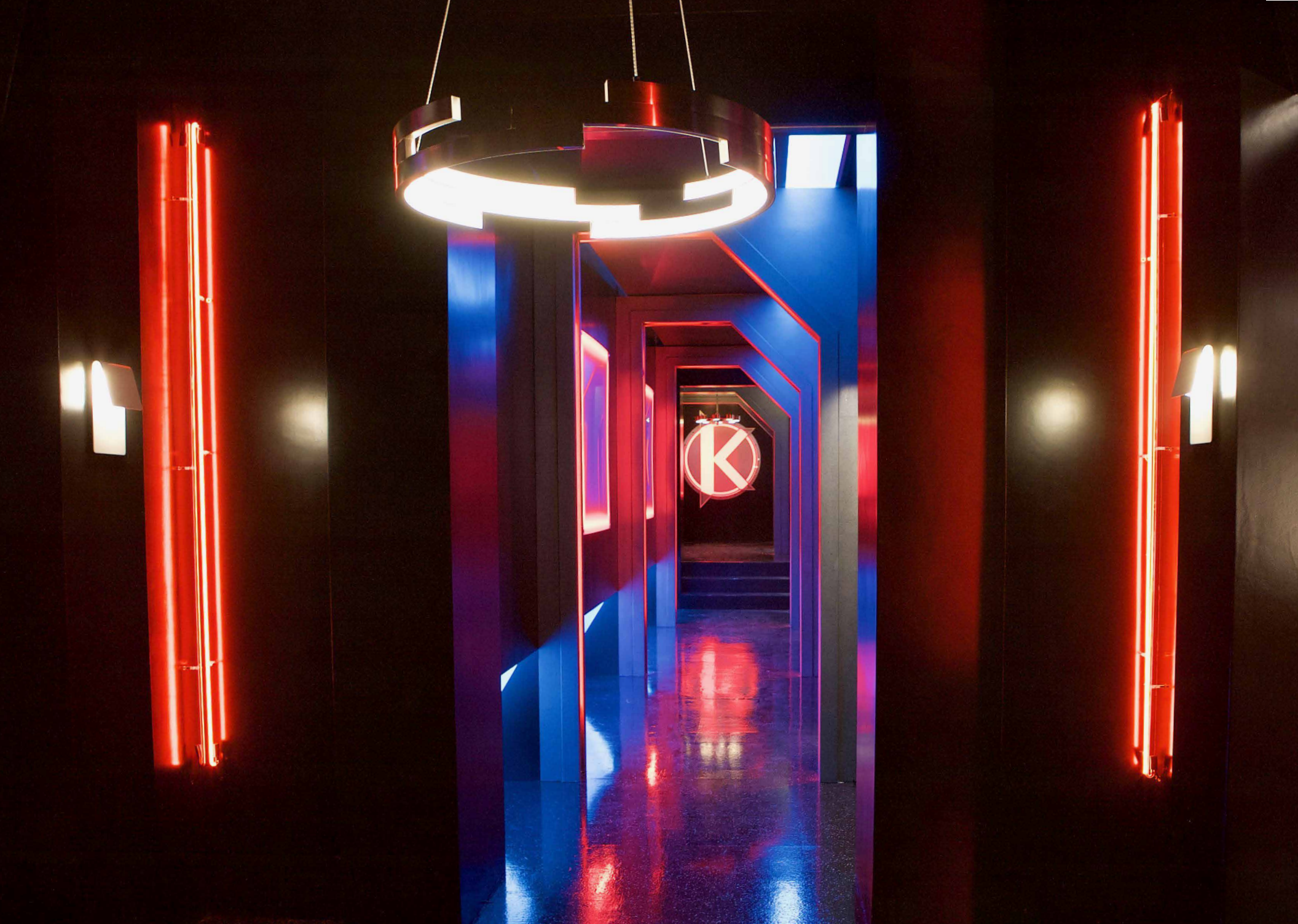
INT. KRONITORIUM - HALLWAY [SONY STAGE 27] YEAR: 2017 - ALTERNATE TIMELINE