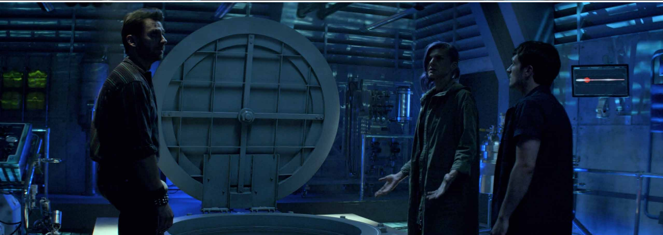
INT. JAMES CAMERON'S HOUSE - "THE ABYSS" LABORATORY [SONY STAGE 27] YEAR: 2023