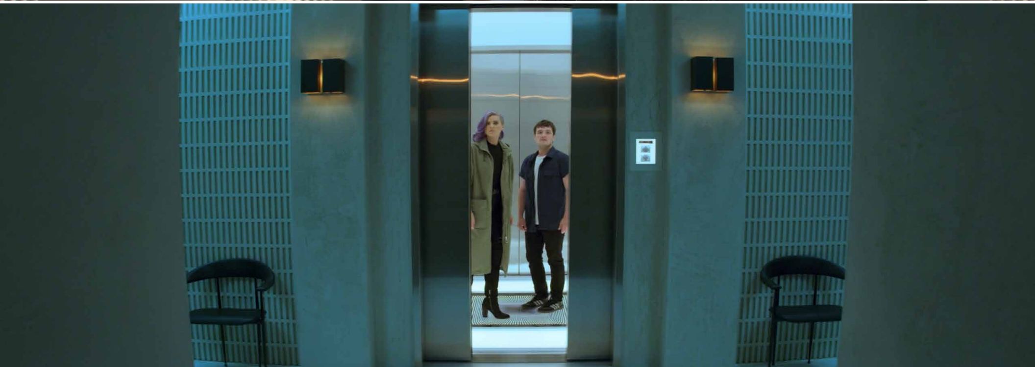
INT. JAMES CAMERON'S HOUSE - ENTRY & ELEVATOR HALL [SONY STAGE 27] YEAR: 2023