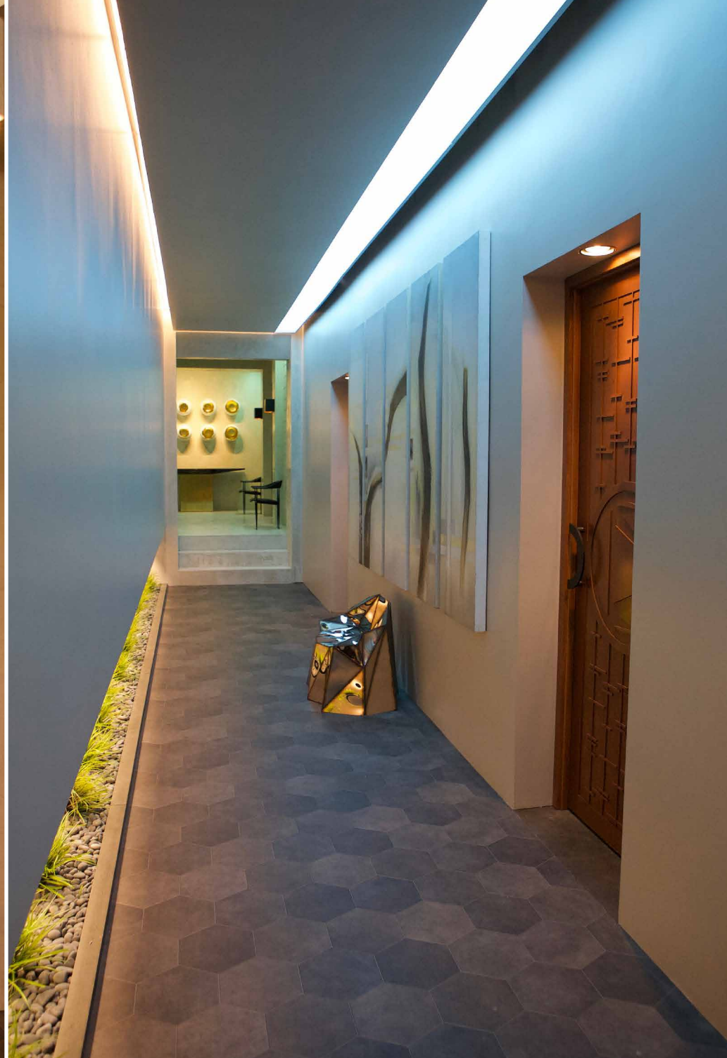
INT. JAMES CAMERON'S HOUSE - ENTRY & HALL [SONY STAGE 27] YEAR: 2023