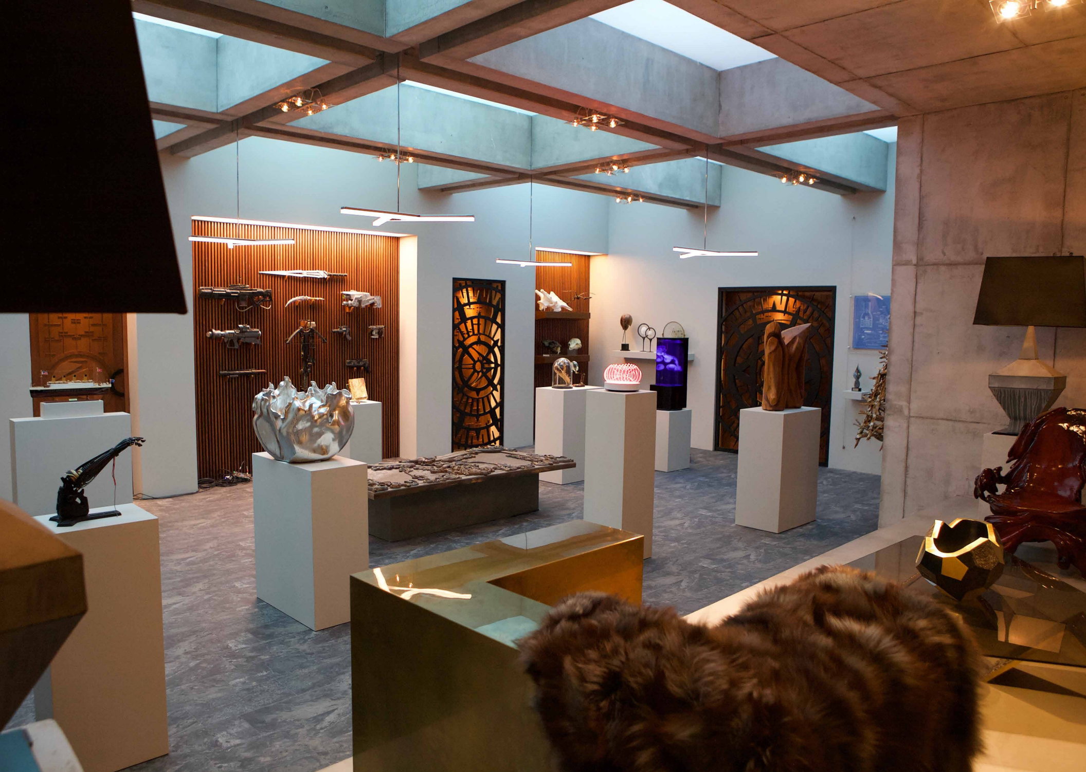
INT. JAMES CAMERON'S HOUSE - "HALL OF JAMES" FILM MEMORABILIA MUSEUM [SONY STAGE 27] - YEAR: 2023