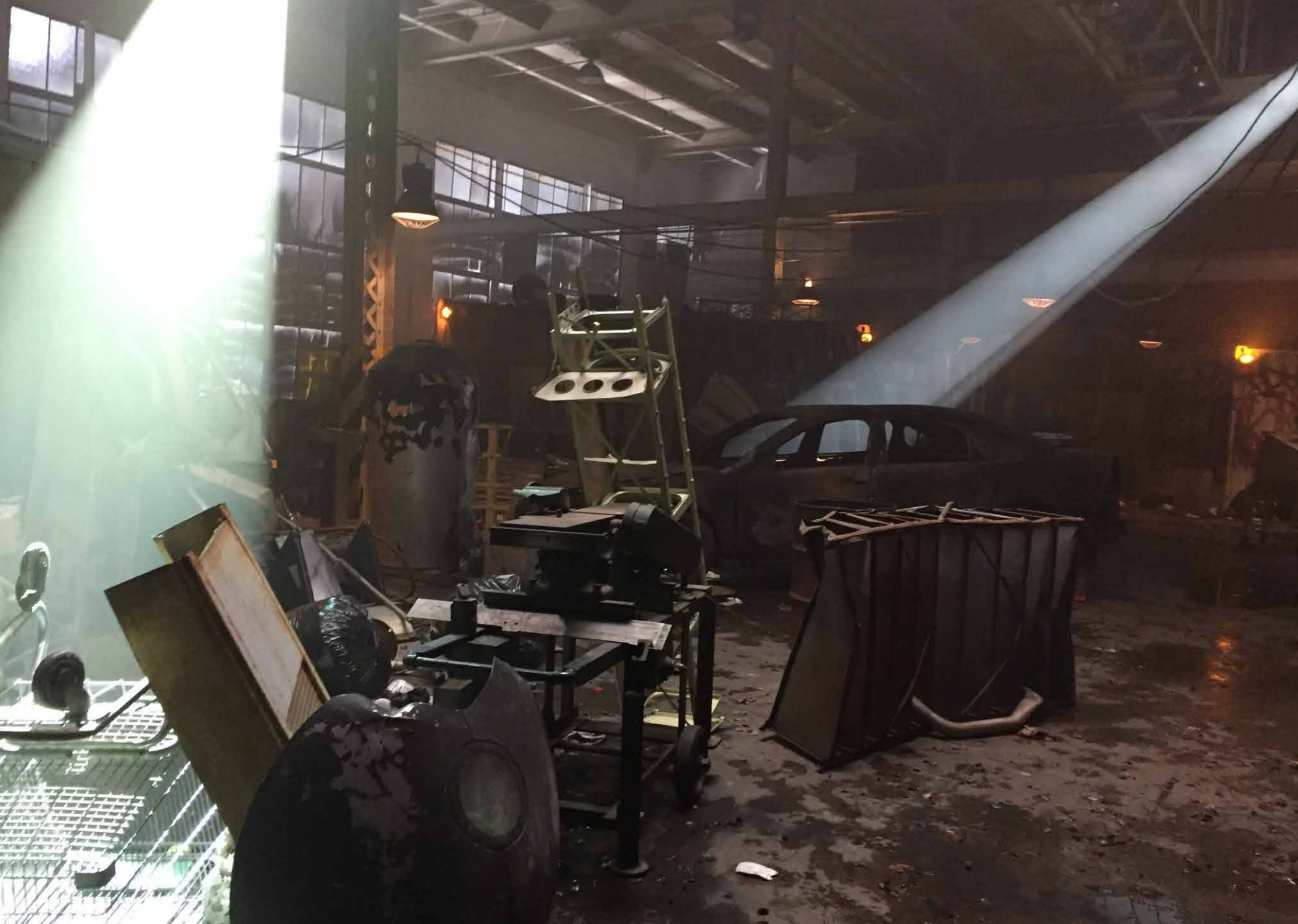
INT. POST-APOCALYPTIC WAREHOUSE [LOCATION] YEAR: 2148 [DREAM SEQUENCE]