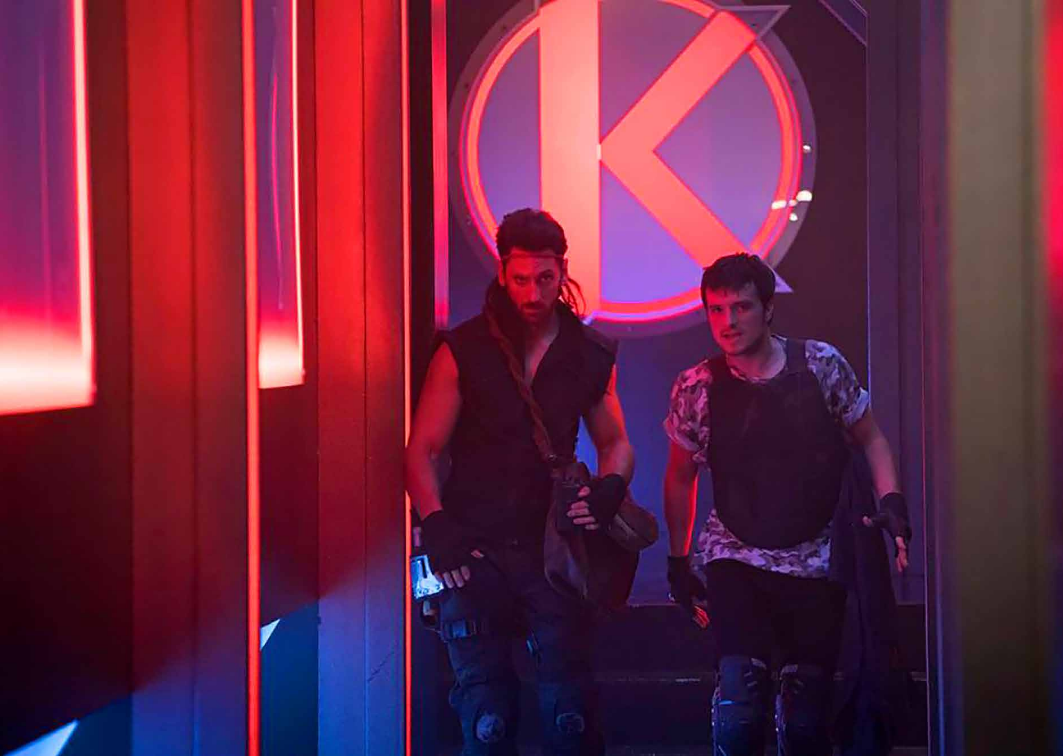
INT. KRONITORIUM - HALLWAY [SONY STAGE 27] YEAR: 2017 - ALTERNATE TIMELINE