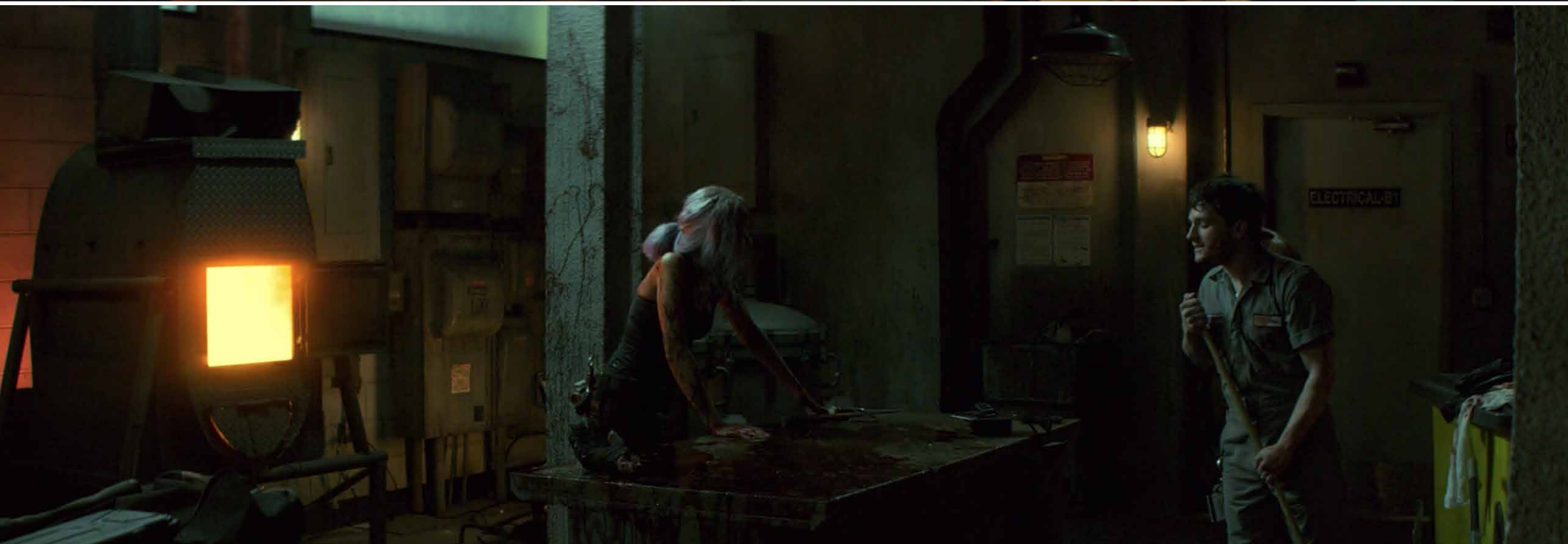
INT. KRONISH LABS - BASEMENT INCINERATOR ROOM [SONY STAGE 27] YEAR: 2017