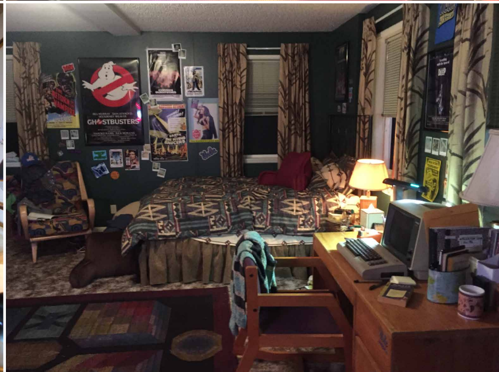
YEAR: 1985 - VARIOUS SETS / TOP: INT. COREY HART'S DRESSING ROOM BOTTOM LEFT: INT. KRONISH HOUSE / BOTTOM RIGHT: INT. YOUNG BARRY'S BEDROOM