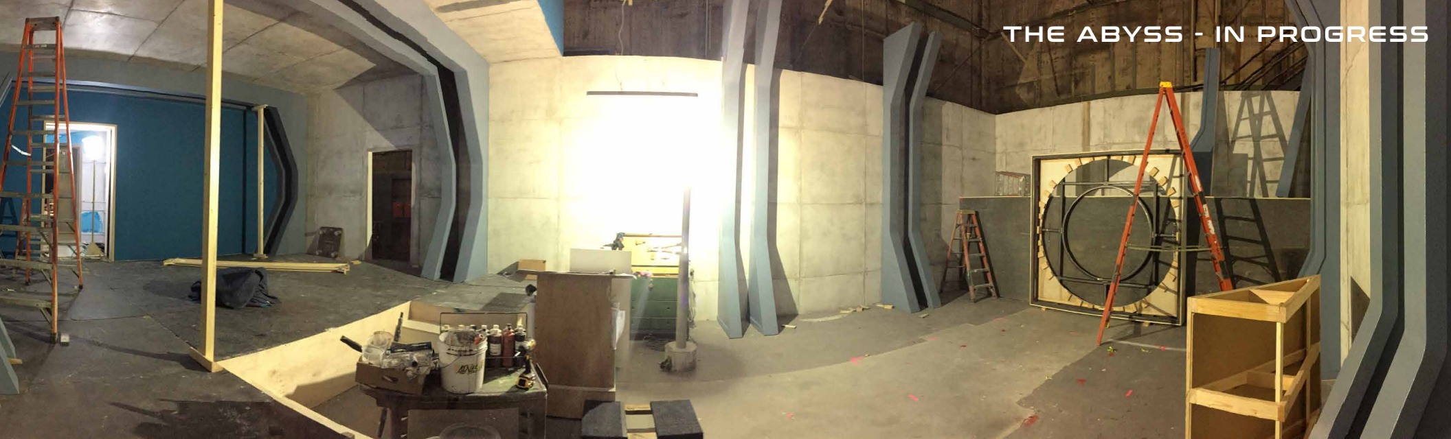
THE ABYSS - IN PROGRESS