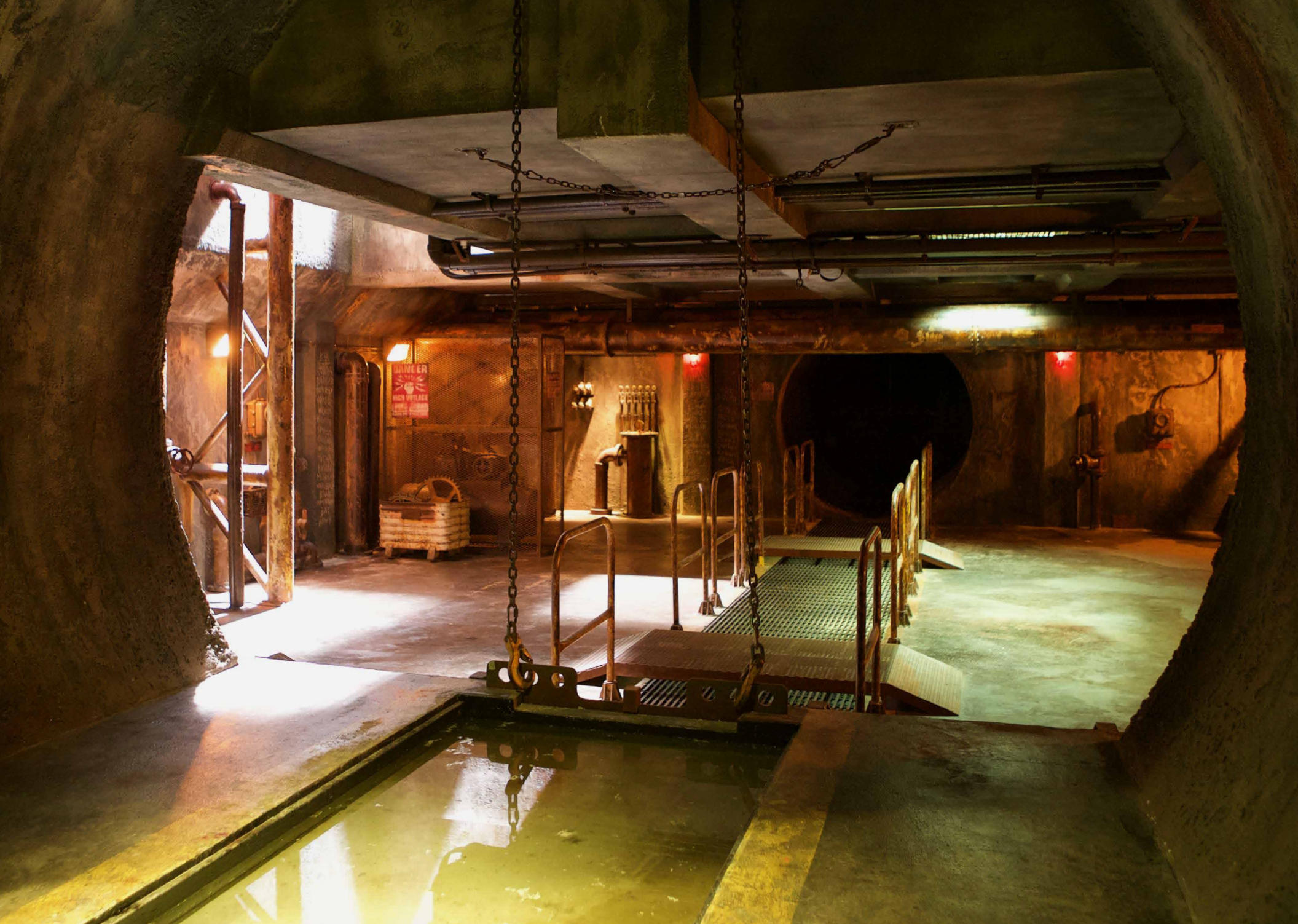
INT. SEWER [SONY STAGE 27] YEAR: 2017