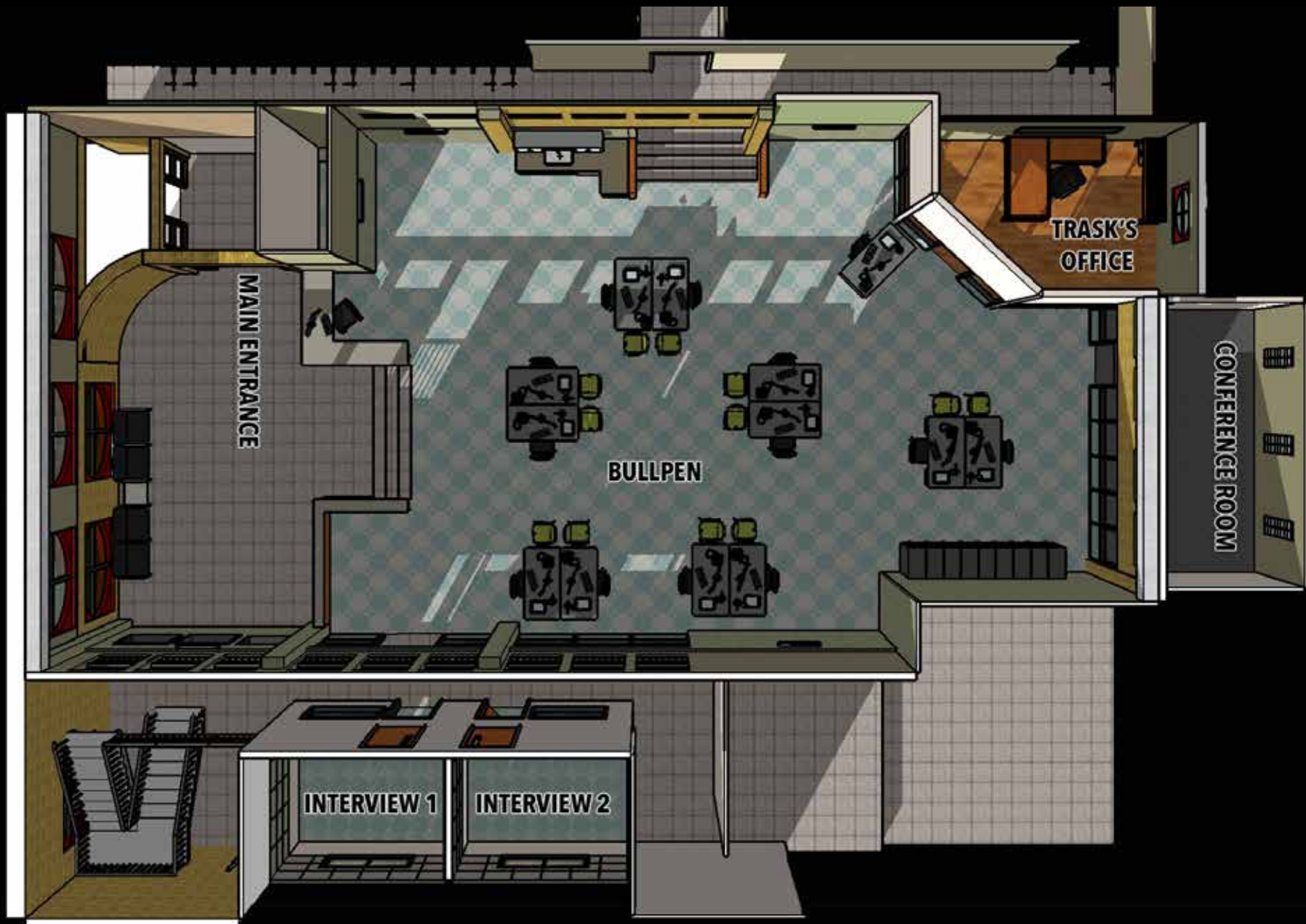
BRADEN POLICE STATION