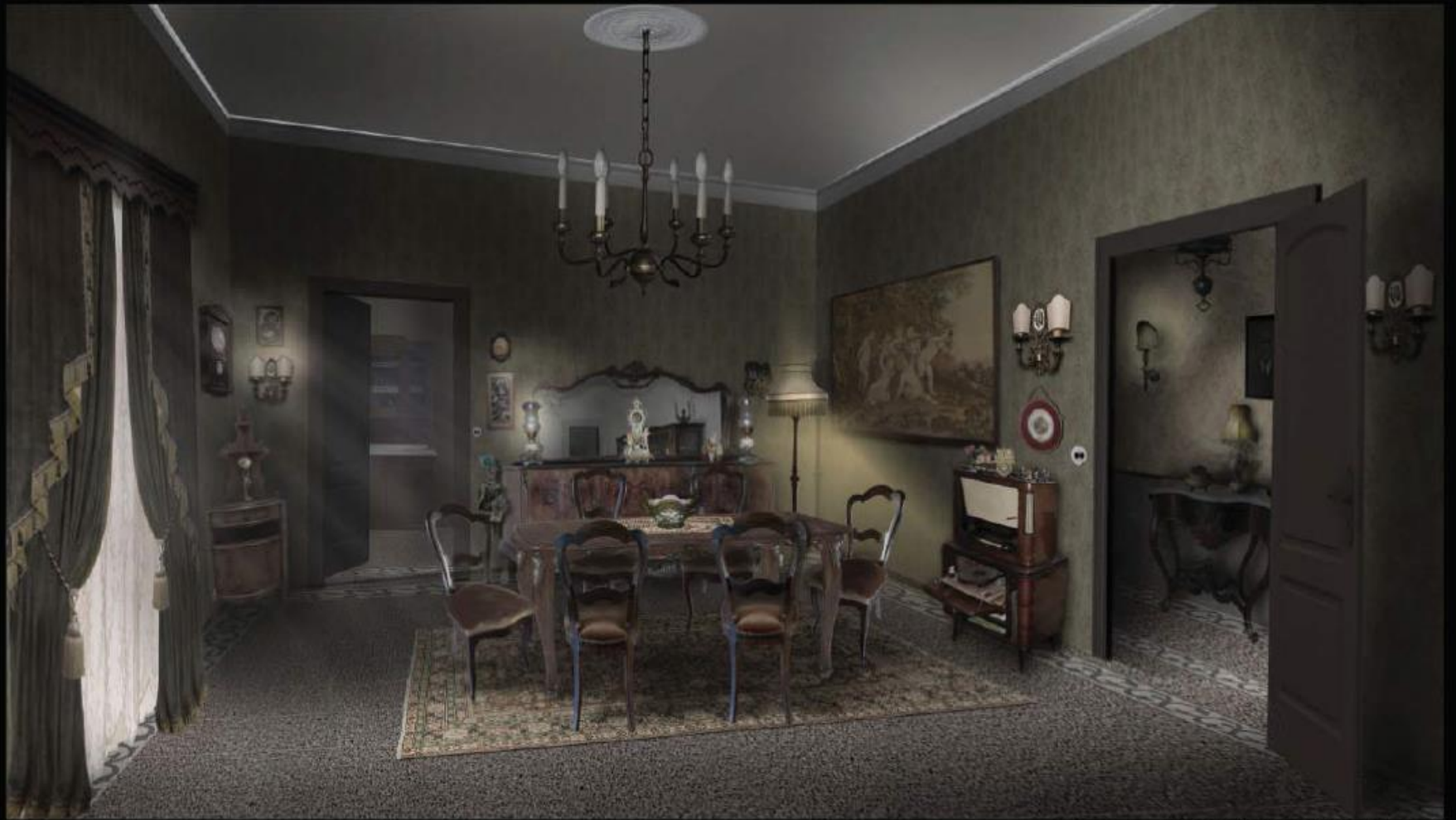
2° IPOTESI SOGGIORNO CARRACCI