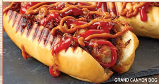
GRAND CANYON DOG

Every 10 minutes your waiter will fire a blast of our world famous beefy beef chili into your mouth from a fire extinguisher. We will keep firing until you tell us to stop!