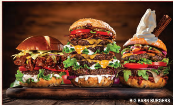
BIG BARN BURGERS