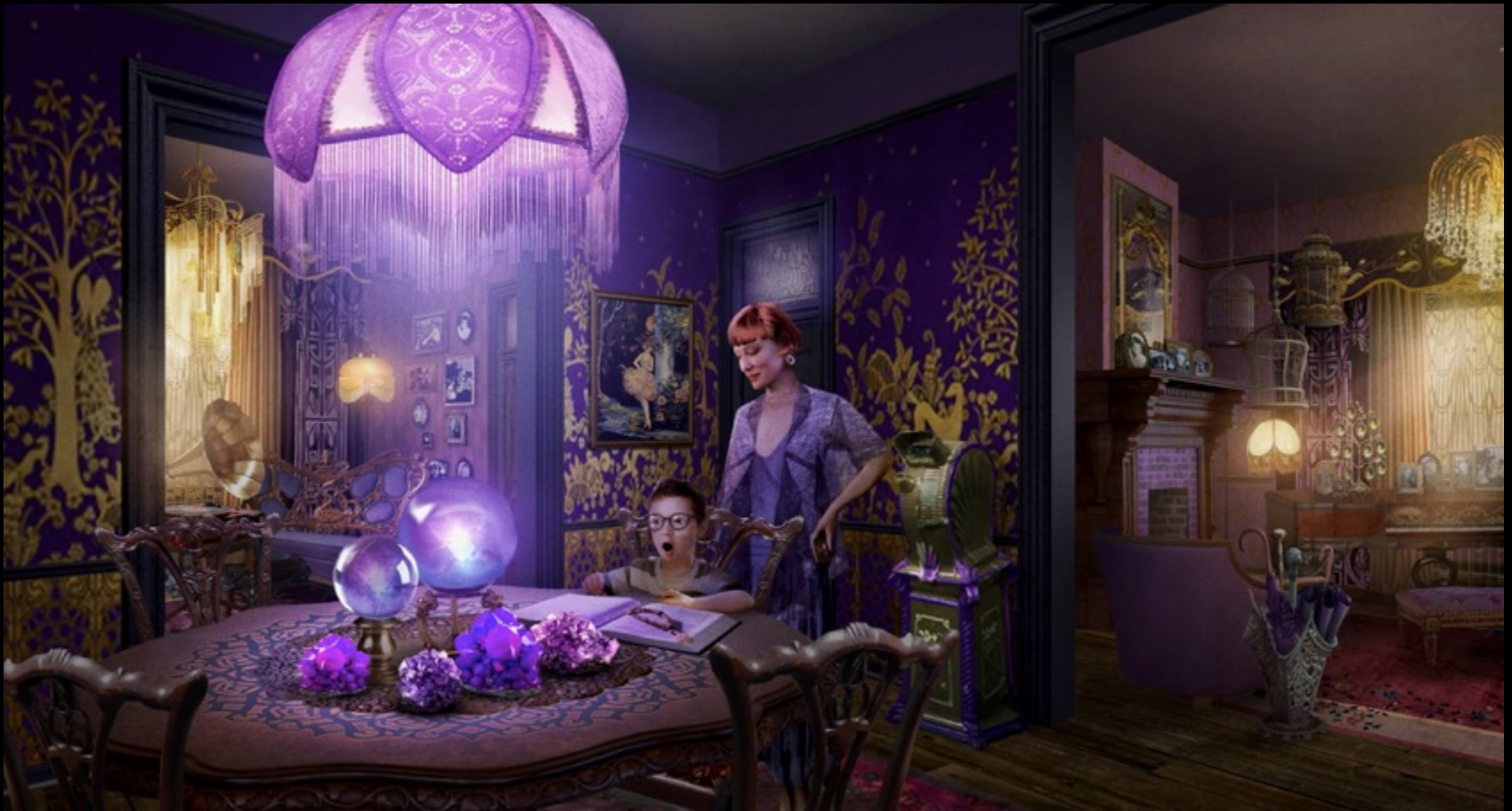
Int. Zimmerman's House