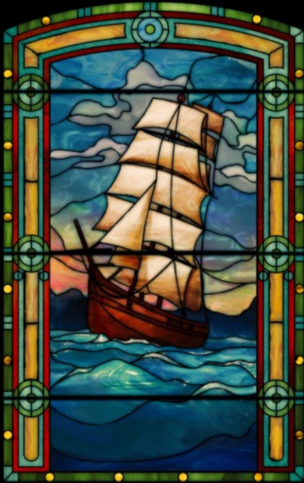
Stained Glass Windows