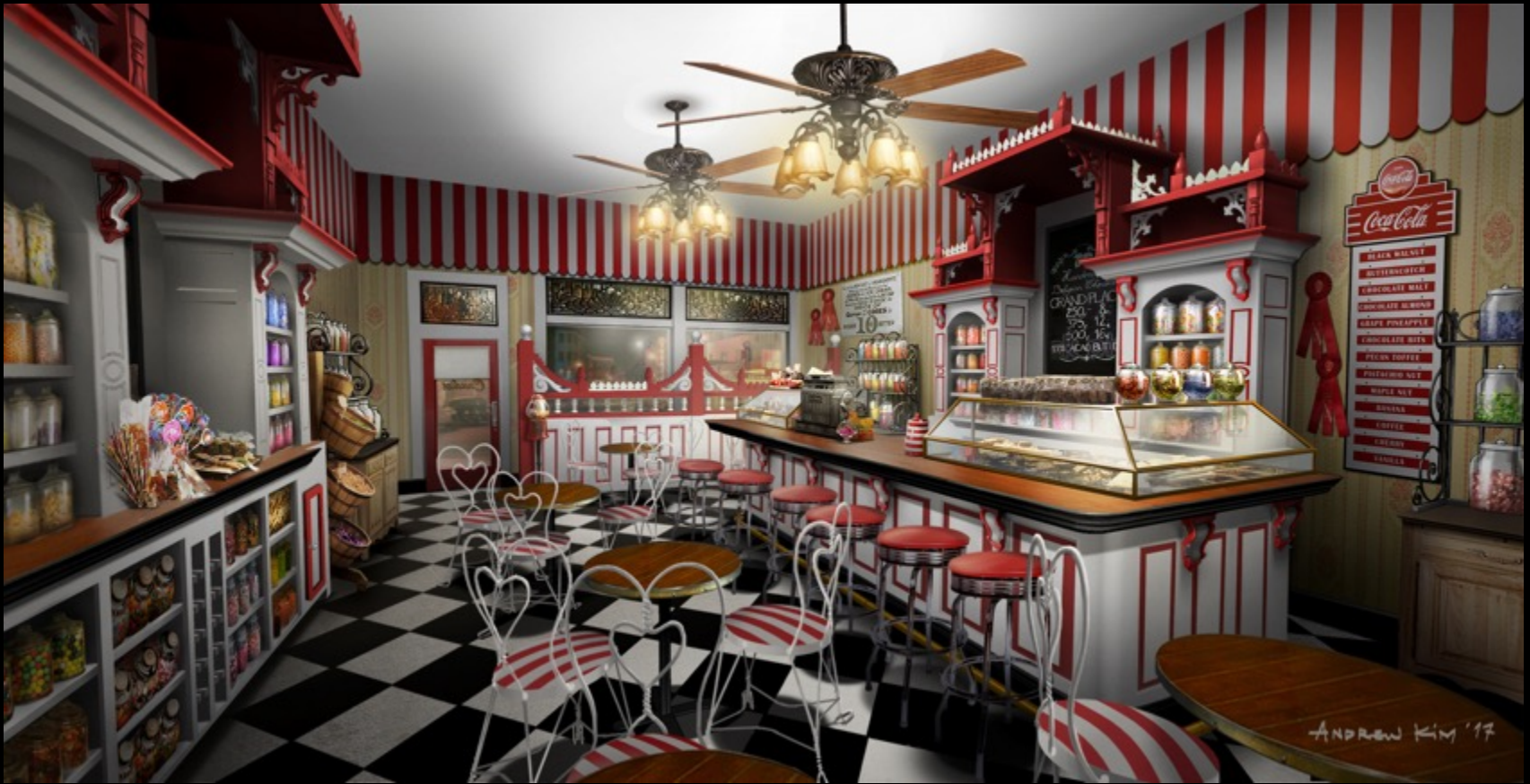
Int. Candy Shop