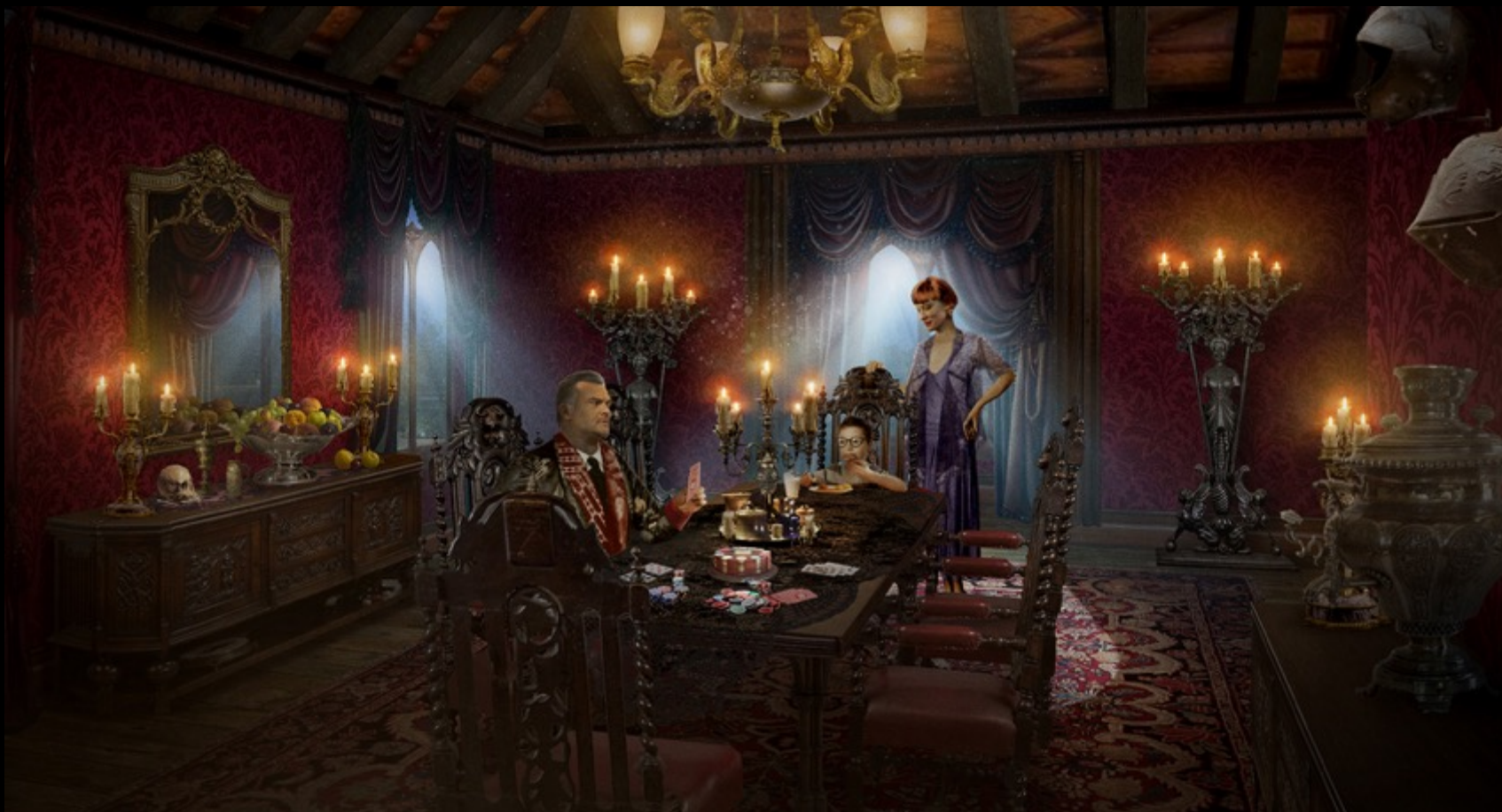
Int. Dining Room