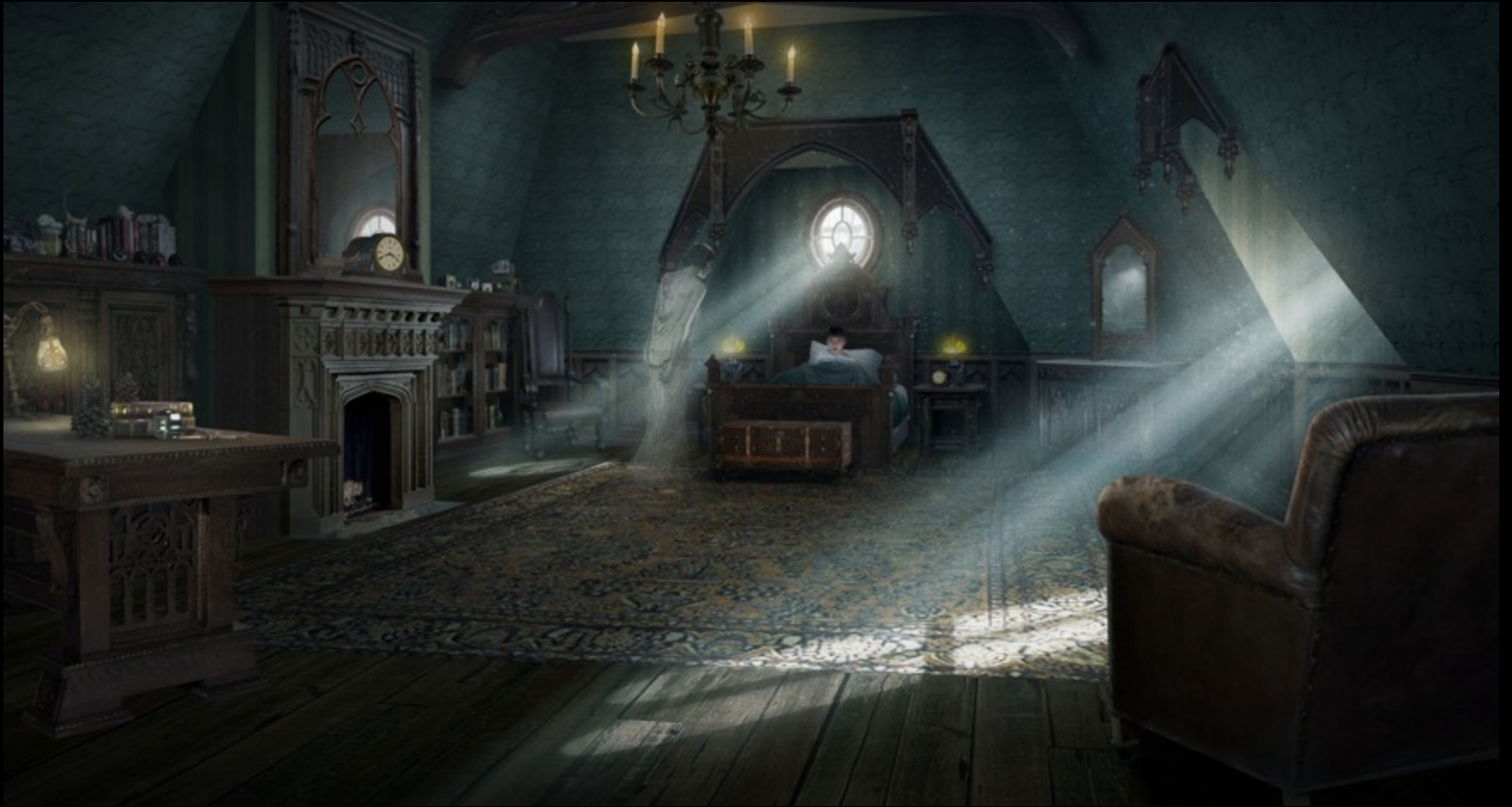
Int. Lewis' Bedroom