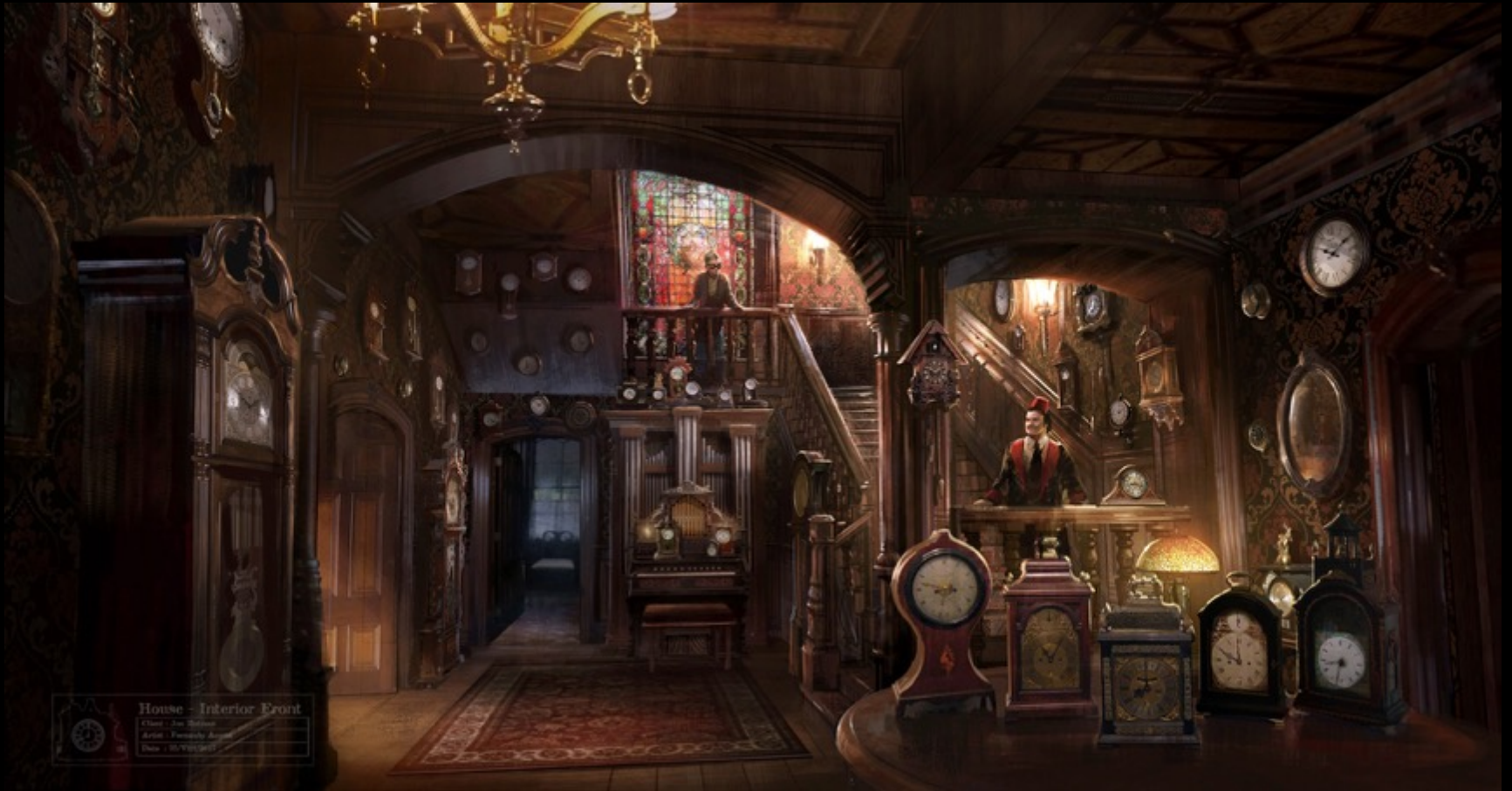
Int. House Entry