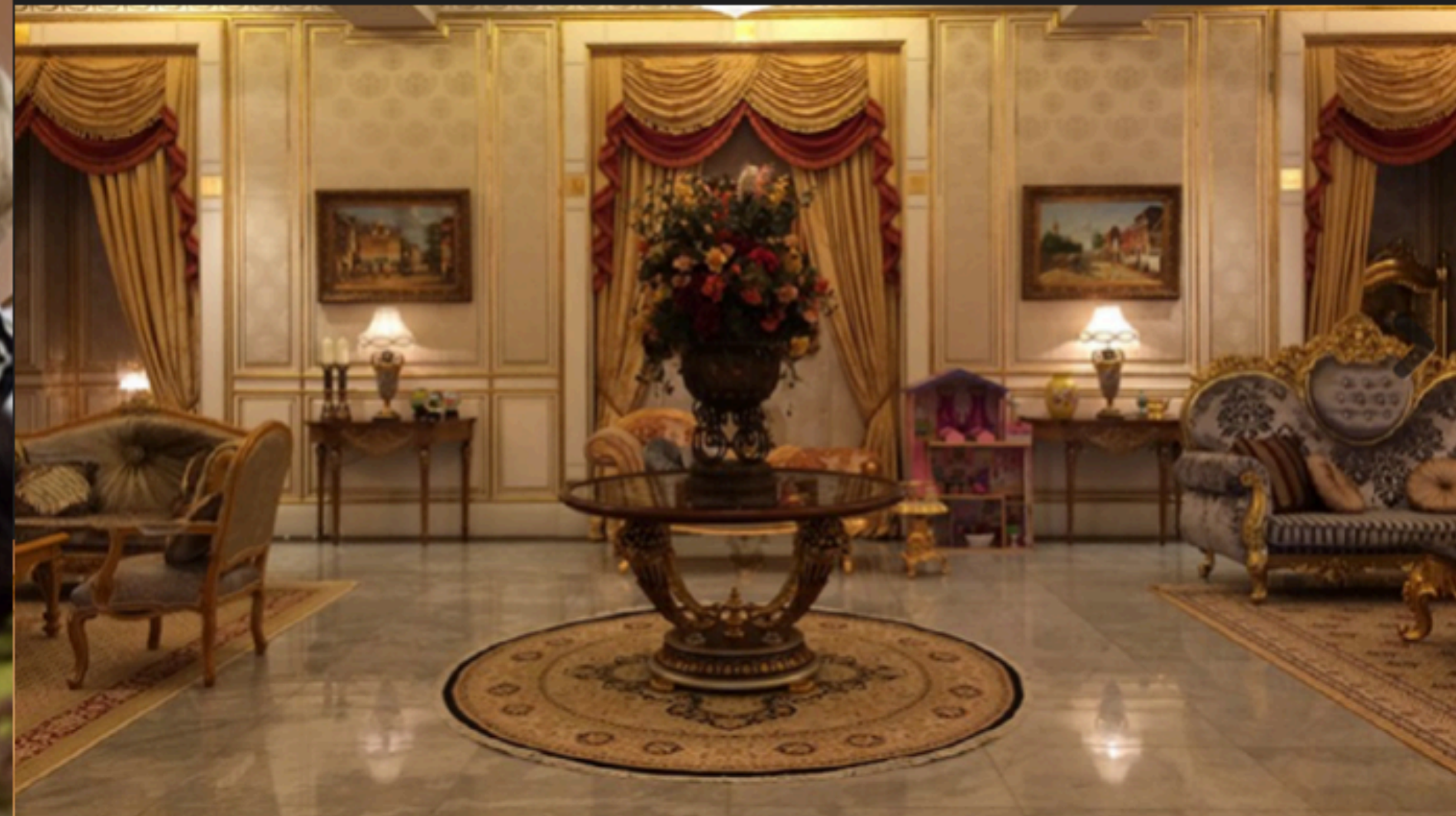
Goh House set Kuala Lumpur