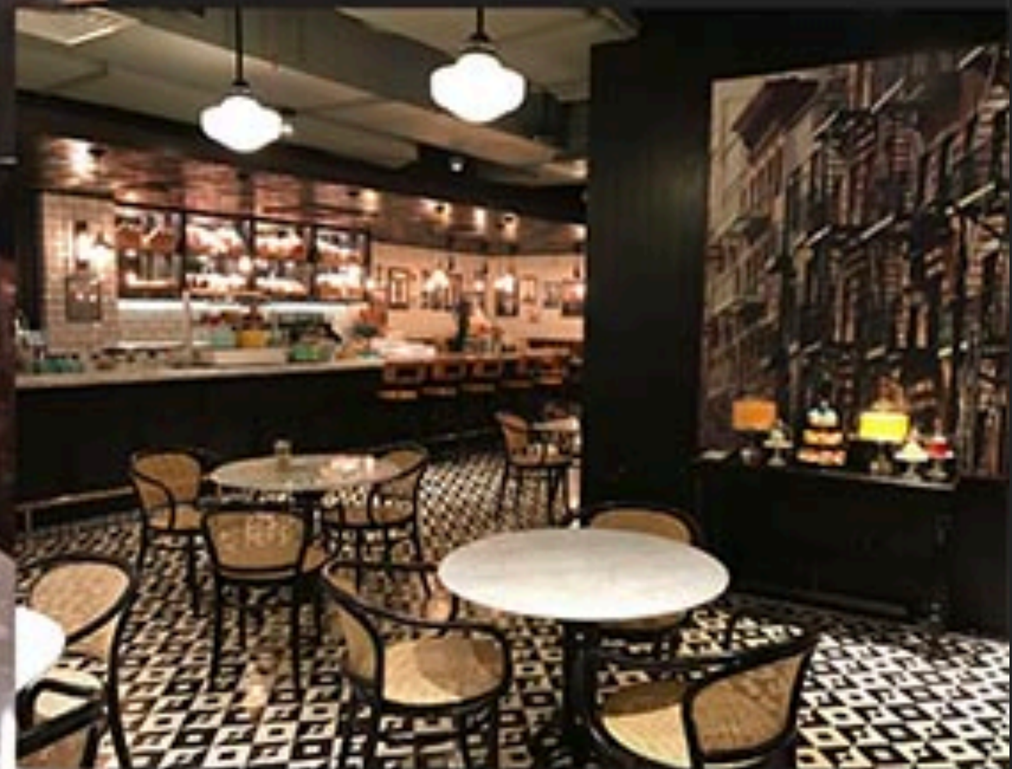
NewYork Cafe set in Kuala Lumpur