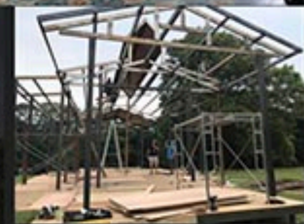
Tyersall Park Conservatory Constructed in 16 days 8 of which were rain