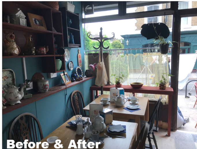
Before & After