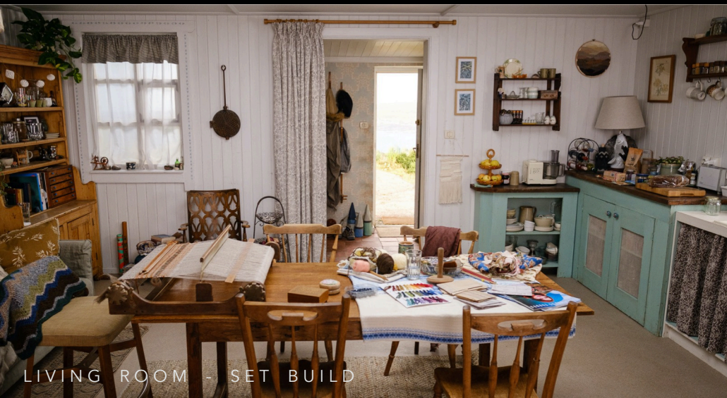
LIVING ROOM - SET BUILD