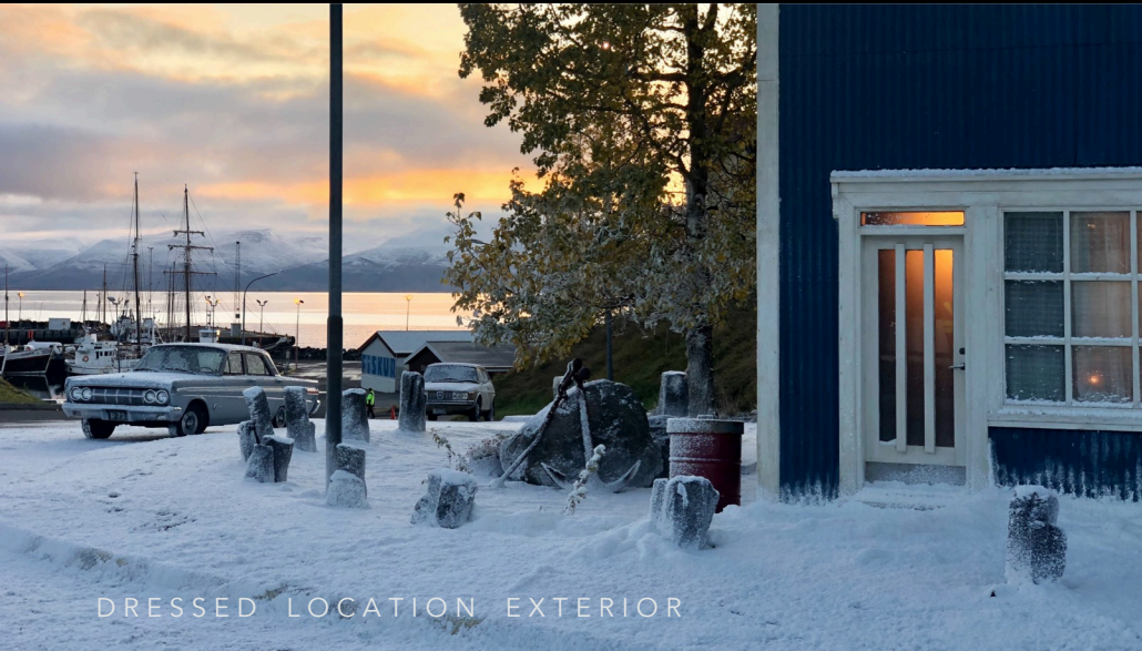
DRESSED LOCATION EXTERIOR