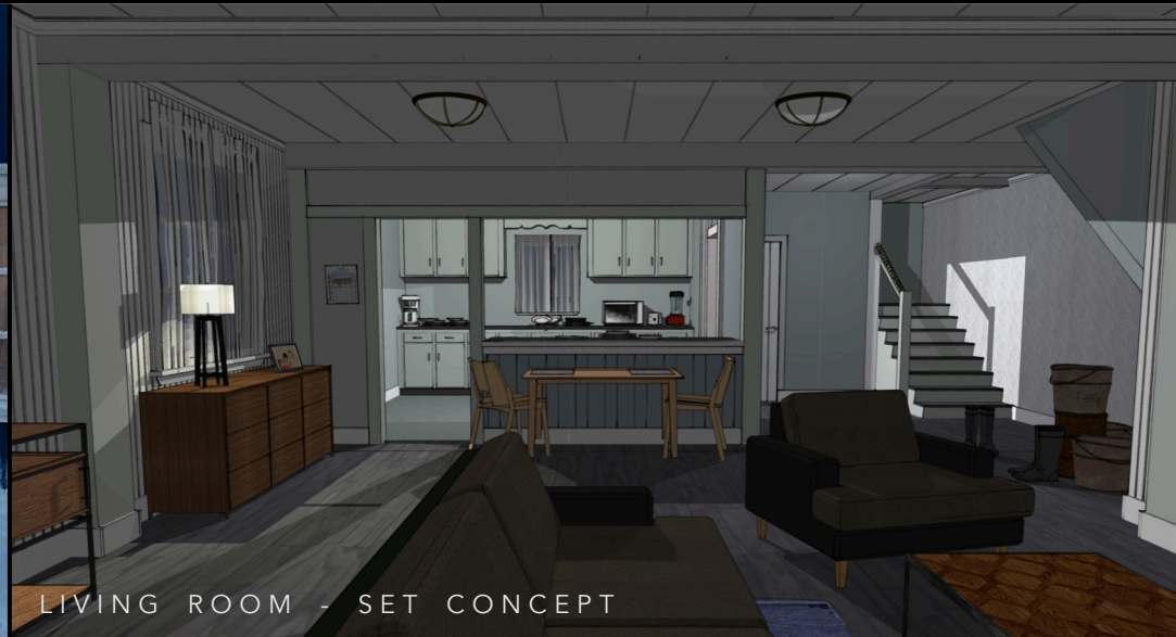
LIVING ROOM - SET CONCEPT