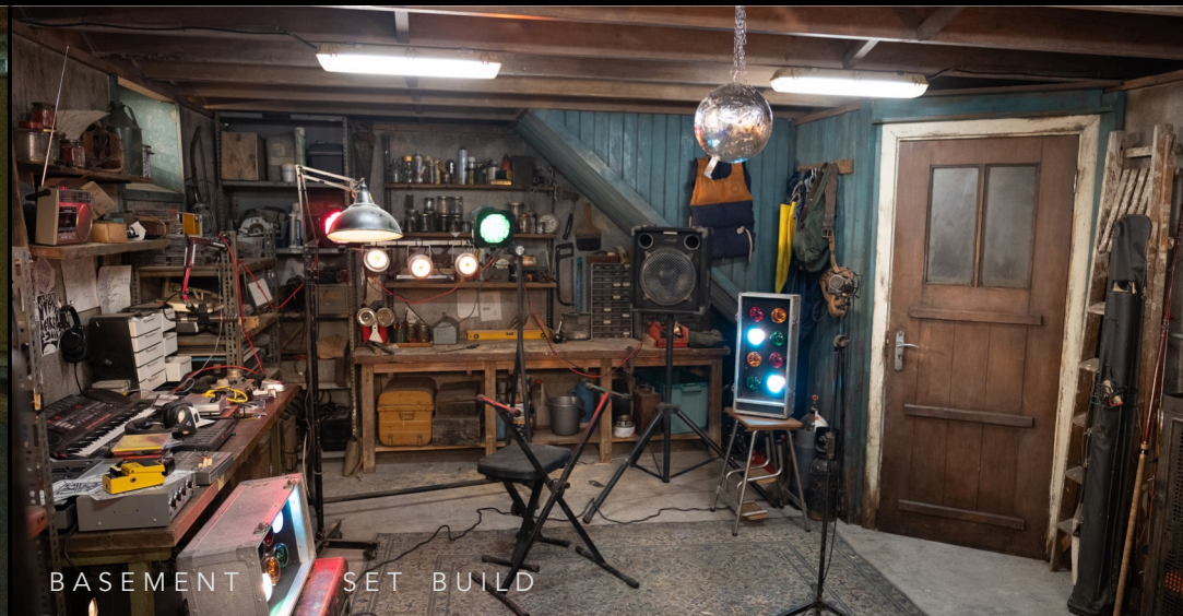
BASEMENT - SET BUILD

Lars and Erick's House is seen both in 1974 and the present day. The exterior was shot on location in Husavik and the interiors were built on stage in the UK.