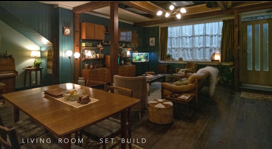
LIVING ROOM - SET BUILD