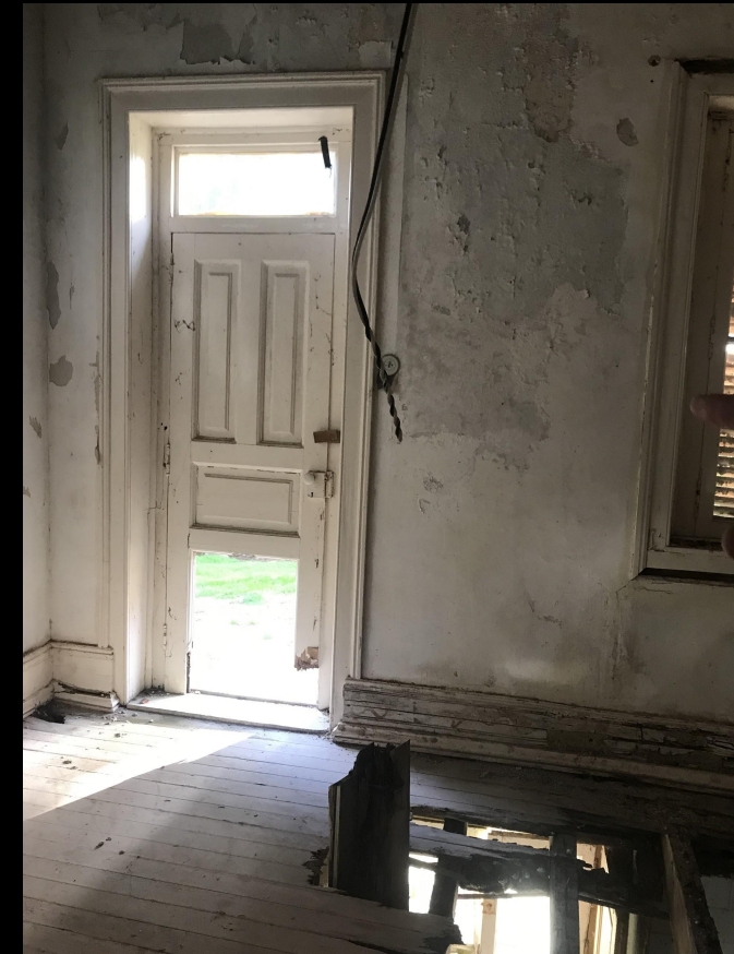
Location Photos of ktichen