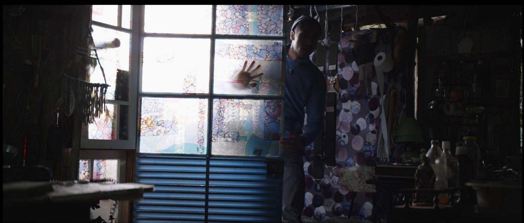
Film Still: Ezra's cabin