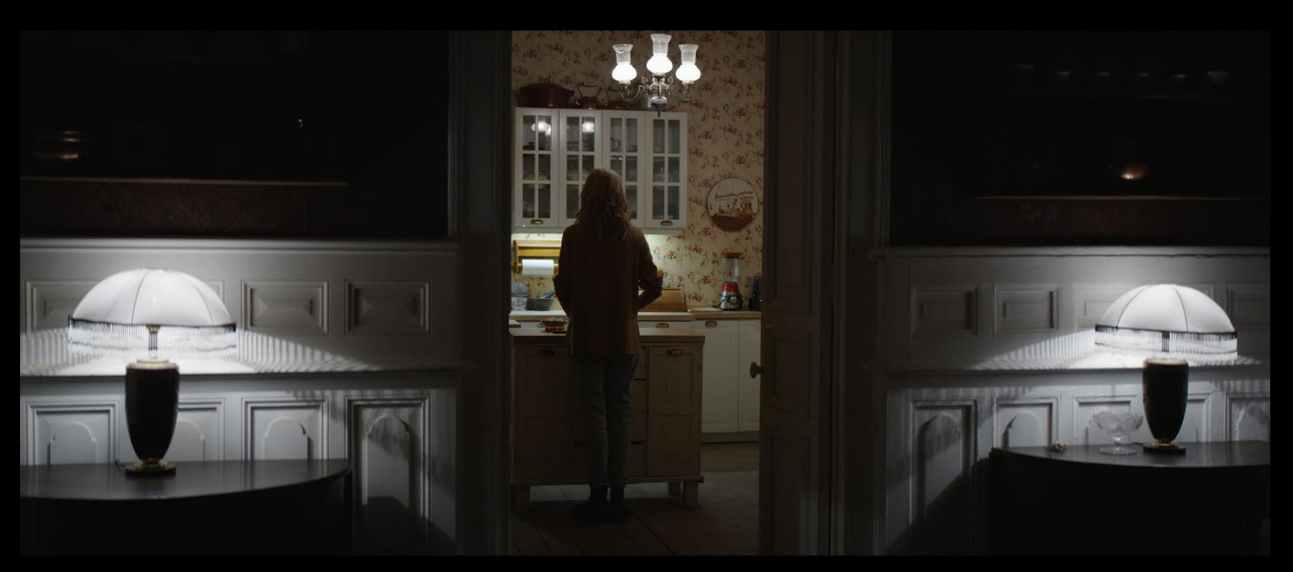
Film Still: Gardner House dining room into kitchen