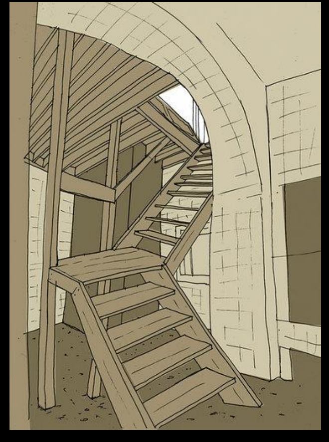
Left: Location photo of basement. Right: drawing of set modification