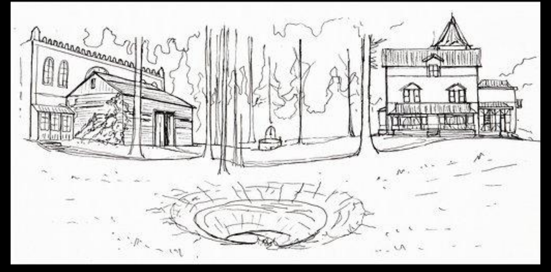
The Gardner Farm: Drawing