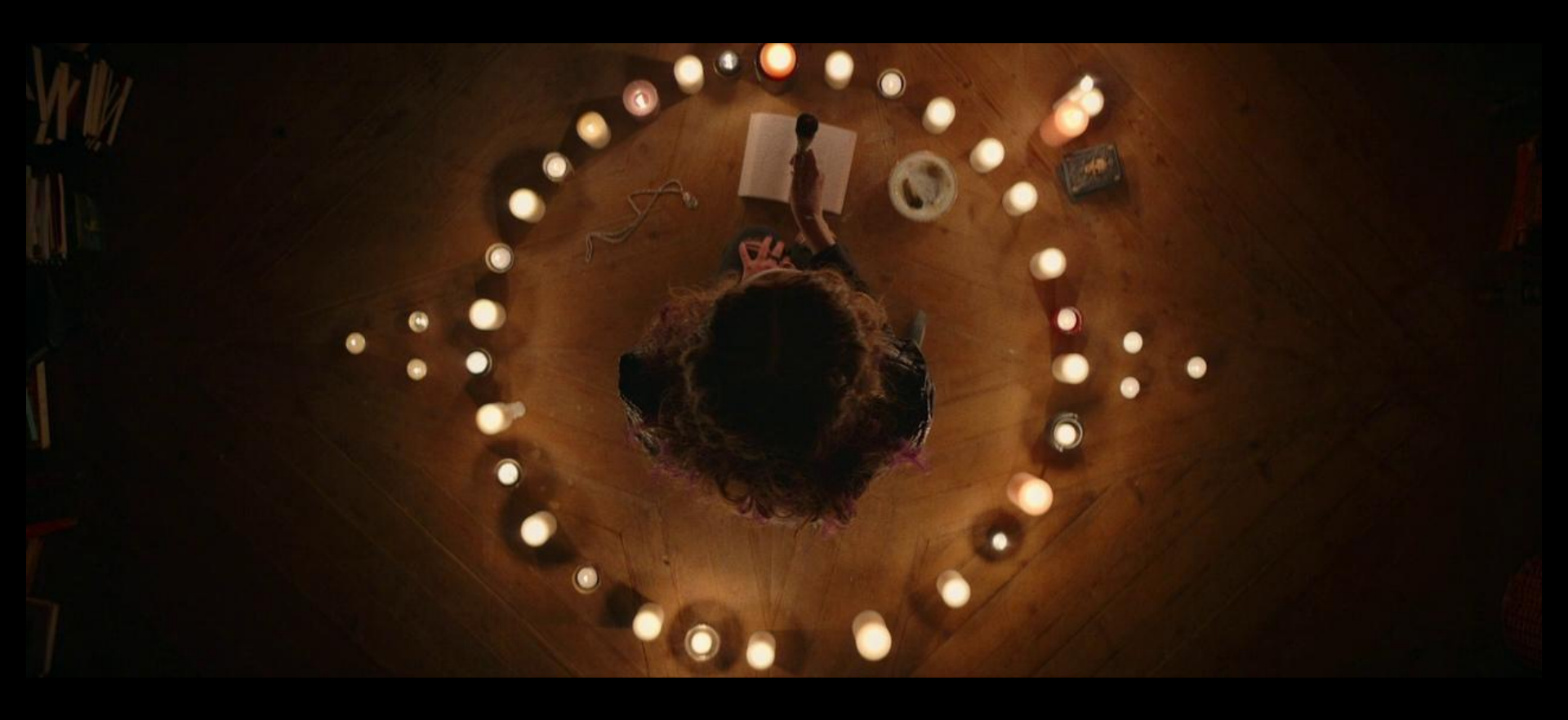
Film Still: Lavinia's bedroom