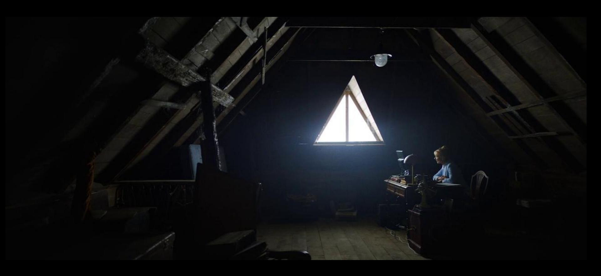
Film Still: Attic Office. Built set