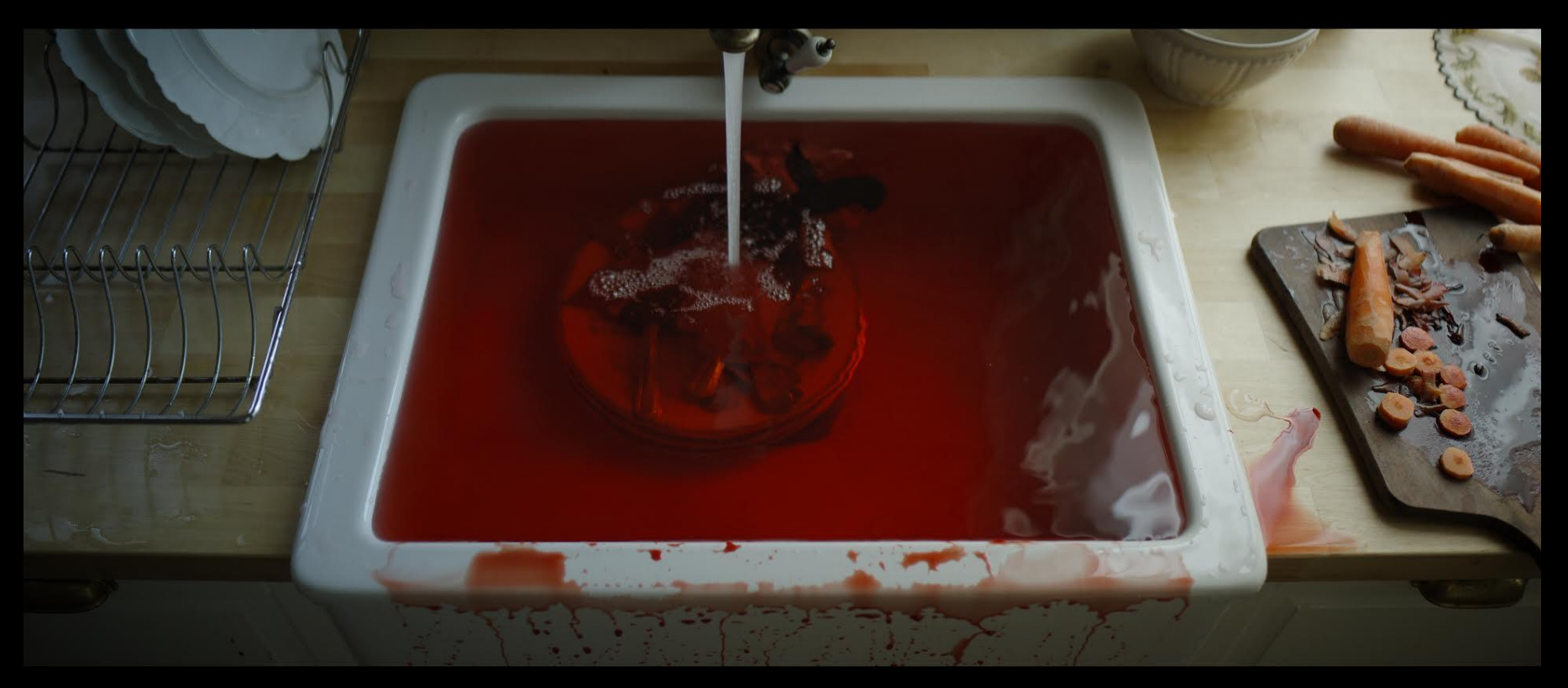
Film Still: Gardner House kitchen counter