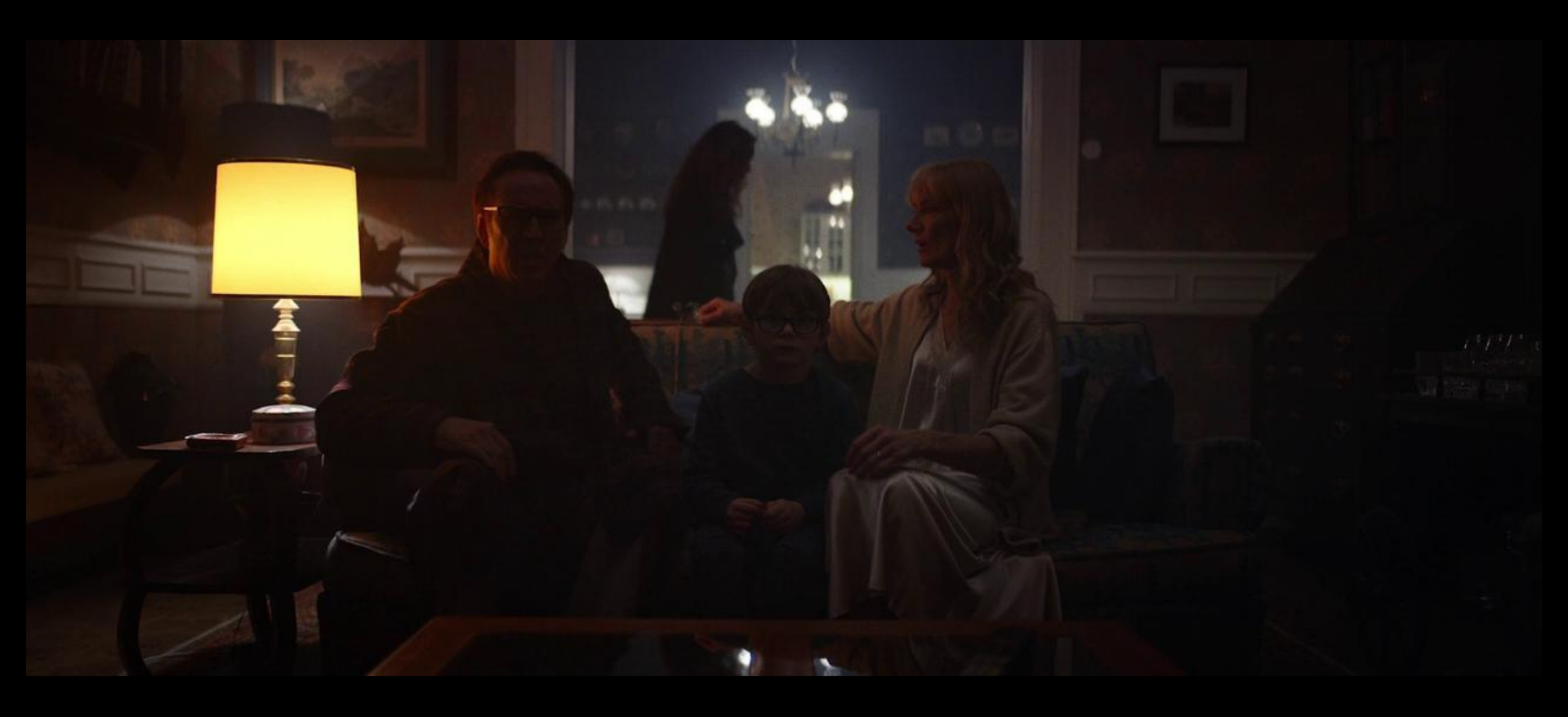
Film Still: Interior Gardner House living room