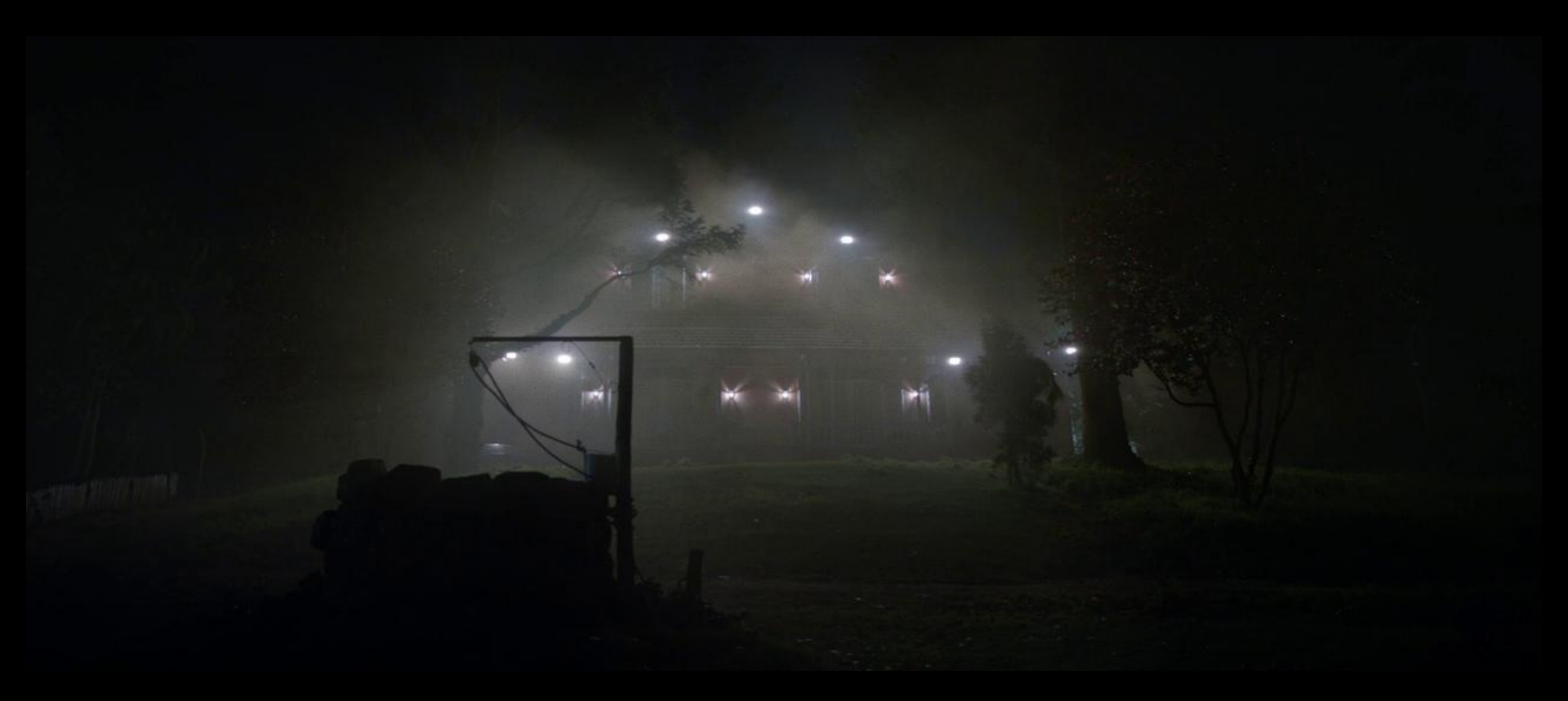
Film Still: Gardner farm and well