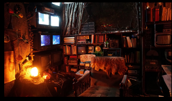
Top Right: Drawing: Ezra's cabin. Others: Photos of interior set decoration