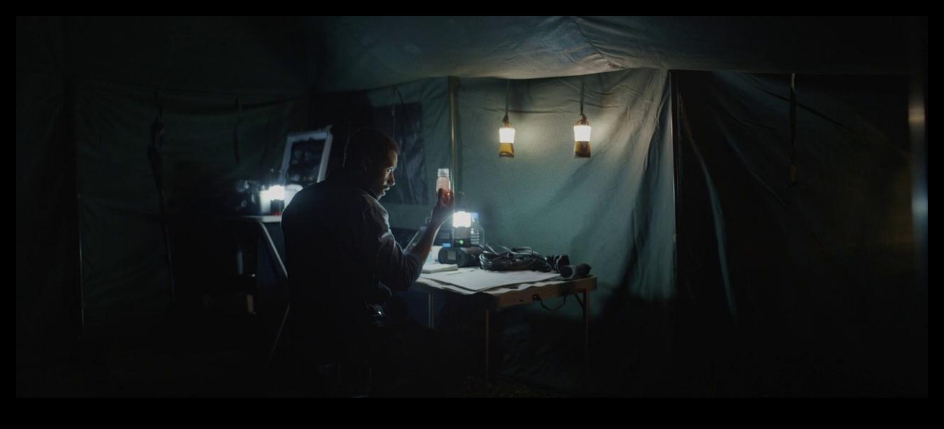
Film Still: Ward's Tent