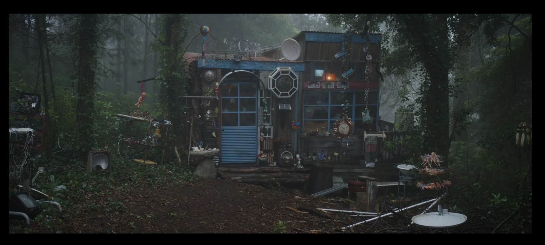
Film Still: Ezra's cabin