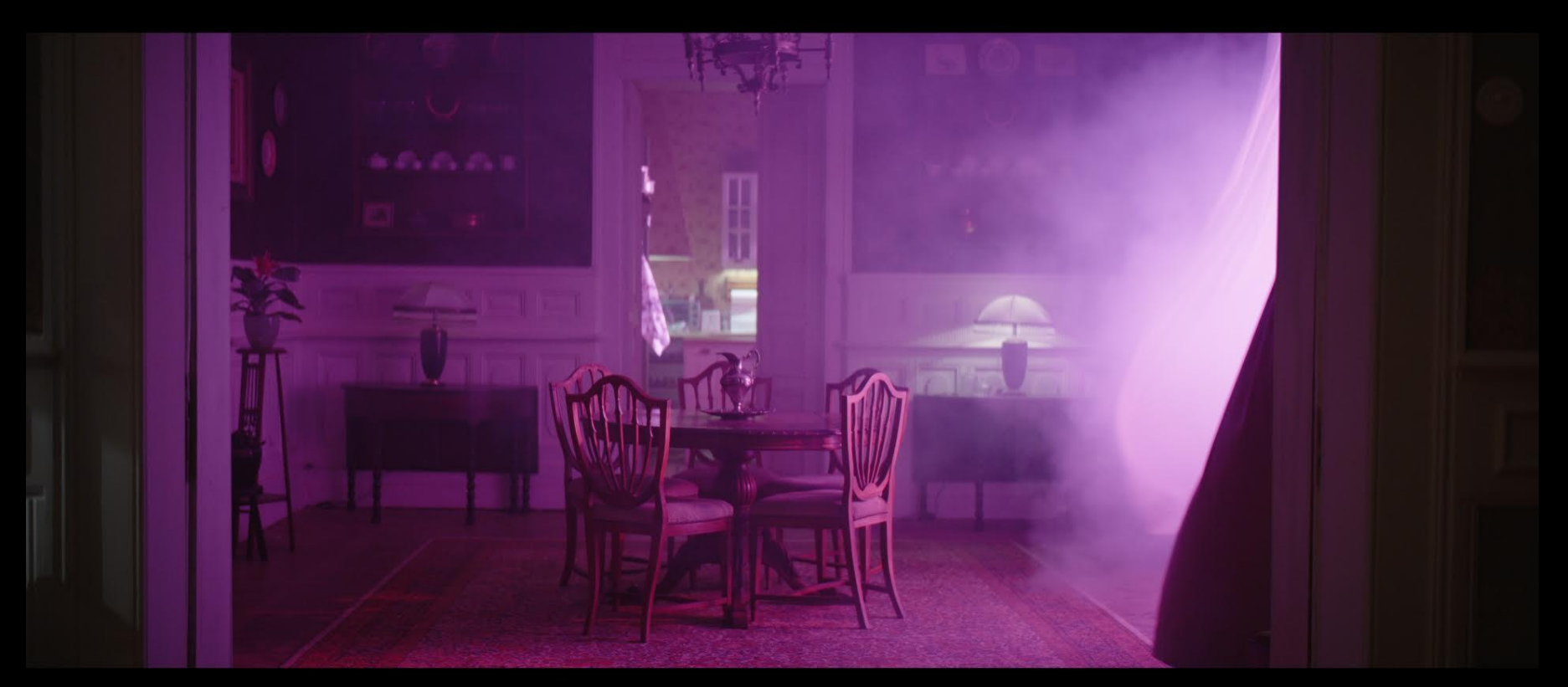
Film Still: Gardner House dining room