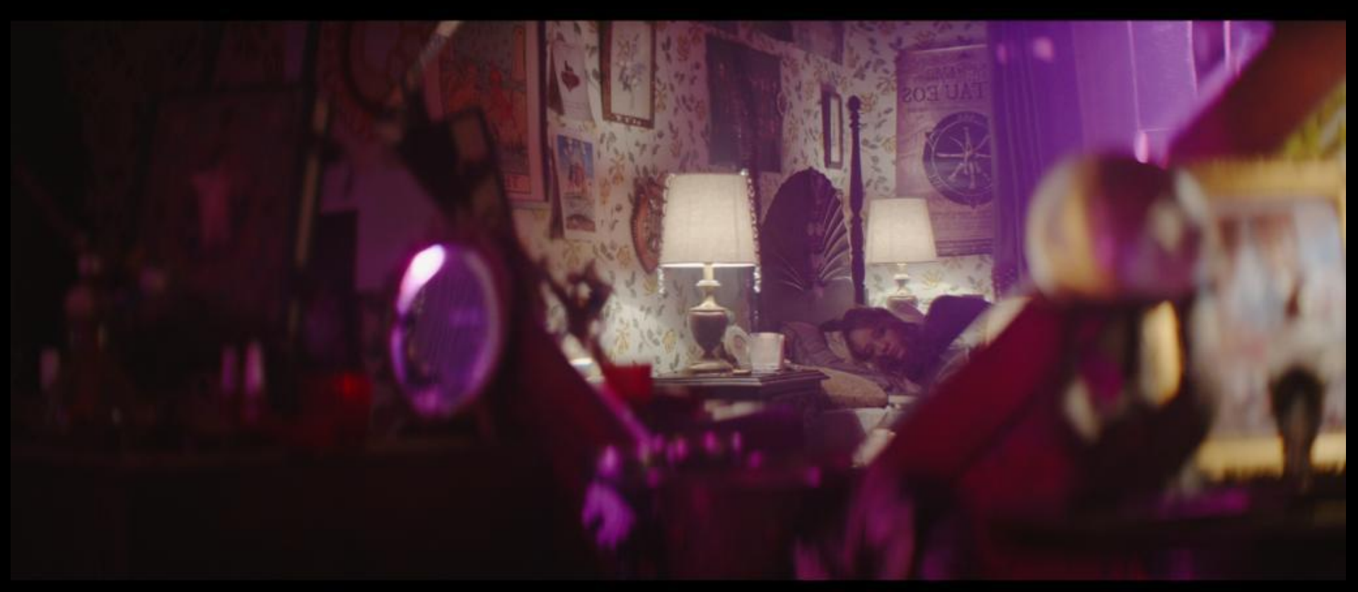
Film Still: Lavinia's Bedroom