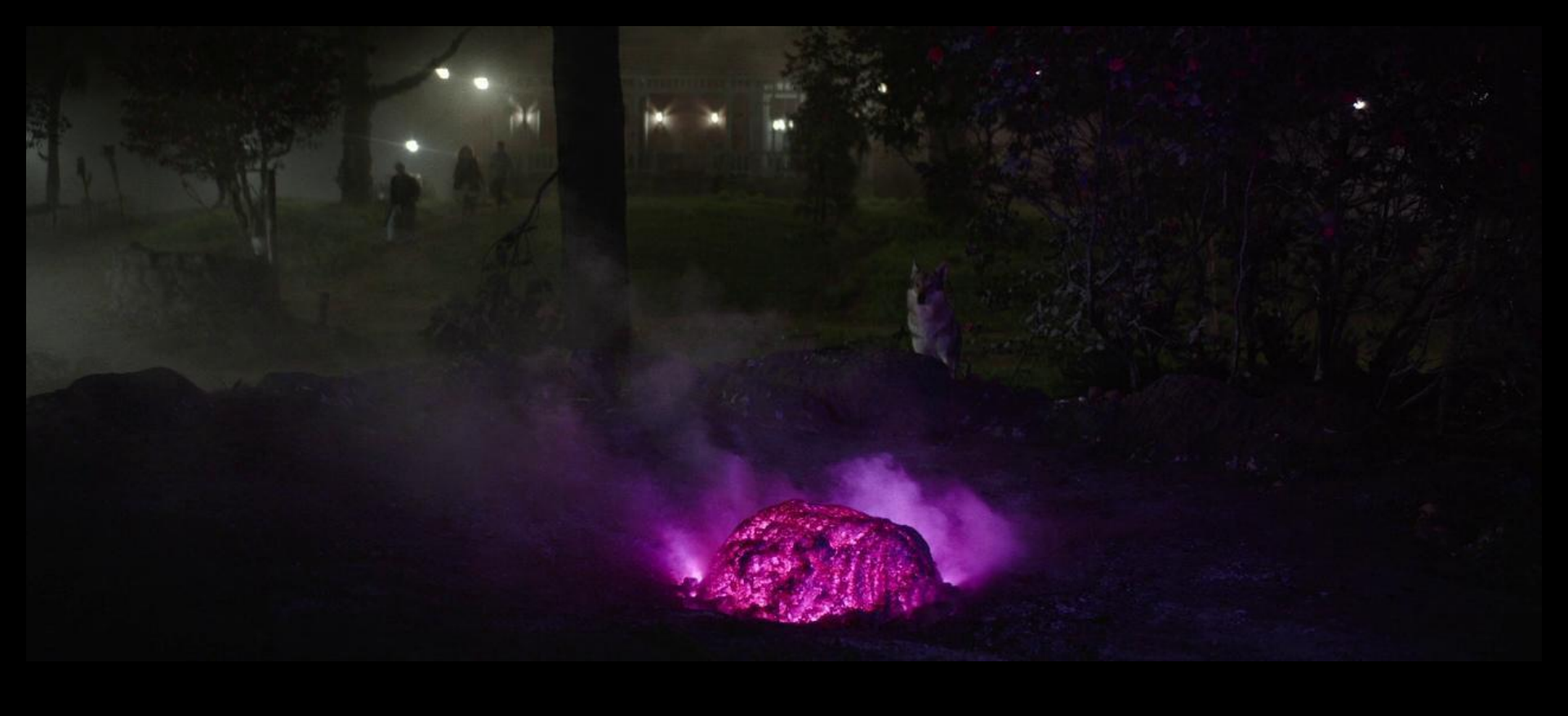
Film Still: Gardner Farm