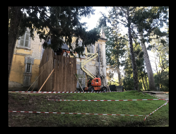
Set Build for the barn