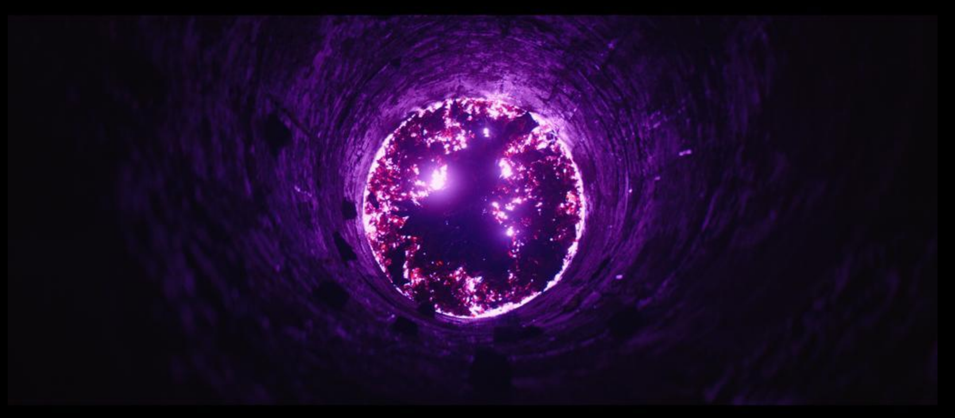
Film Still: Gardner Gardner House well