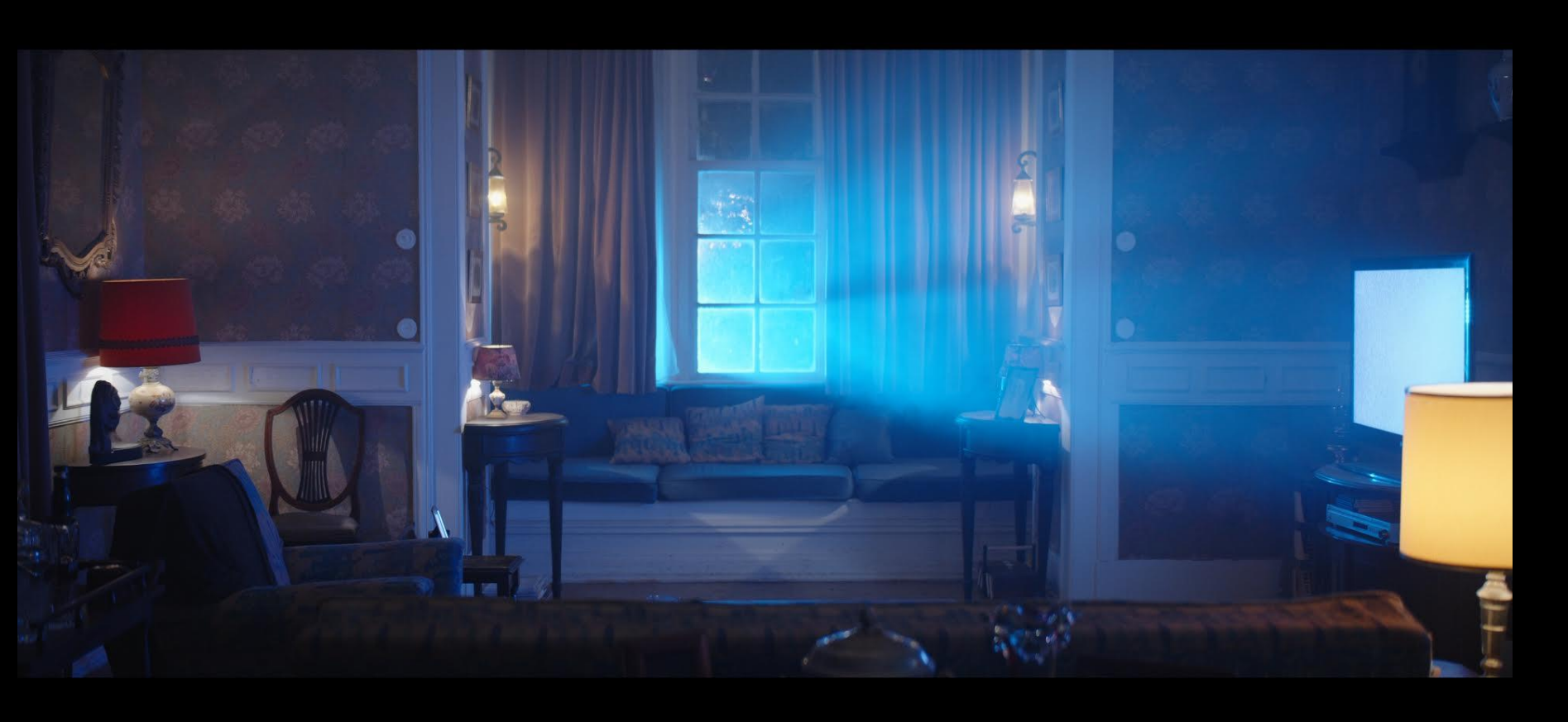
Film Still: Gardner House Living Room