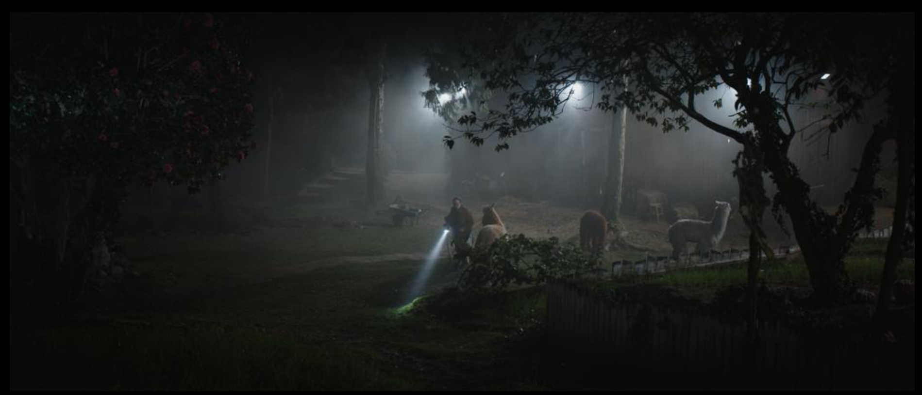
Film Still: Gardner Farm