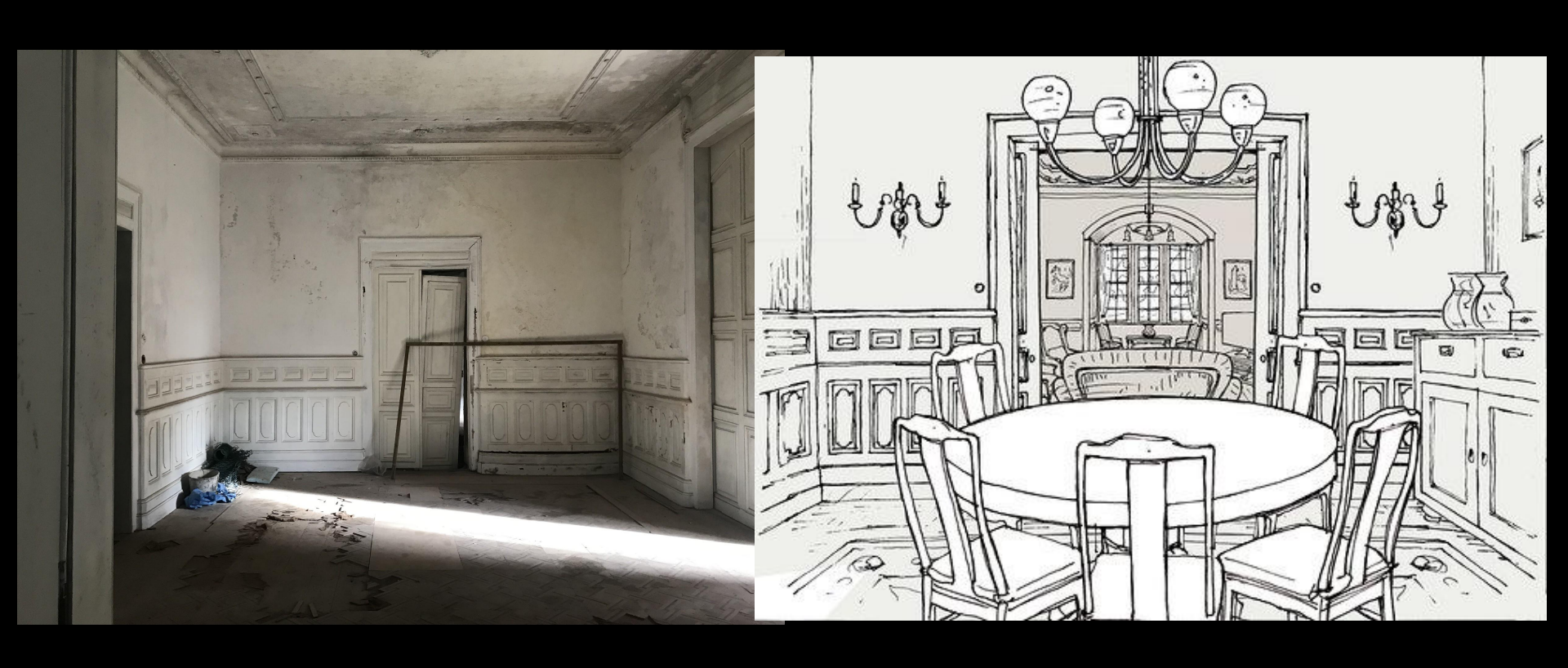
Left: Location Photo: Dining room Right: Drawing of dining room