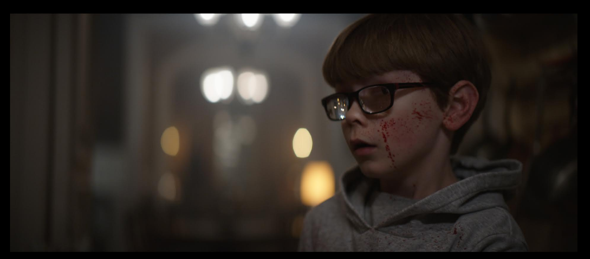
Film Still: Gardner House dining room into living room