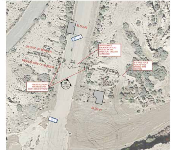
01 SITE PLAN - BORDER CROSSING