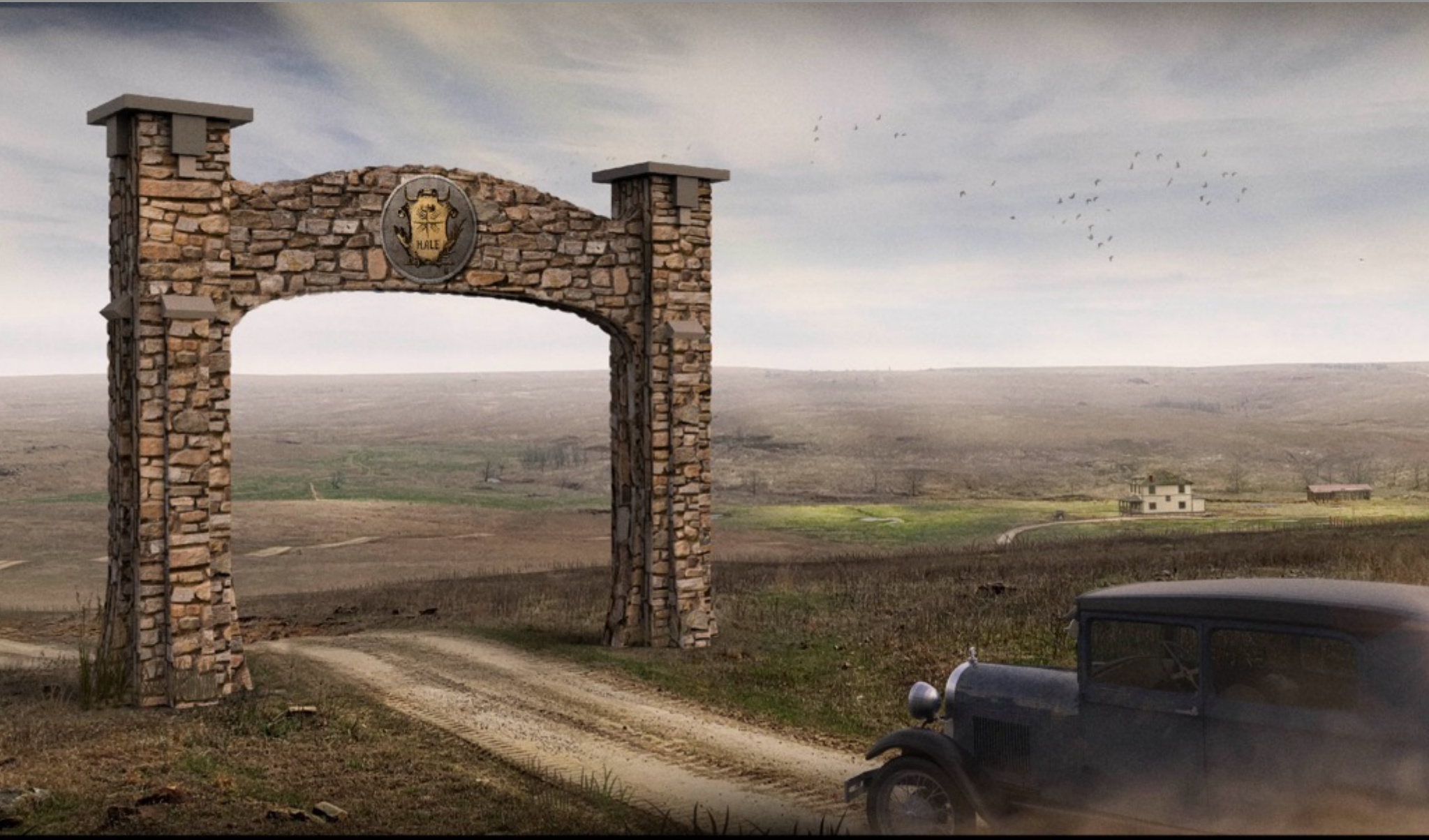
The gate to Hale's property

By 1920, Hale had amassed about 50,000 acres of Osage land through leases and purchases.