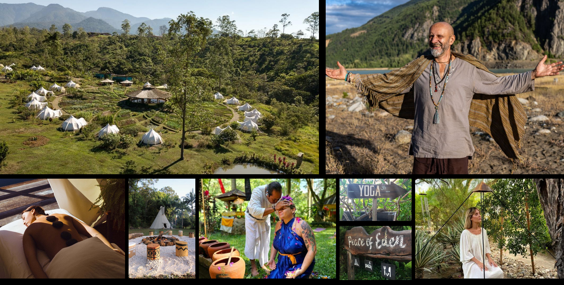
HUMANIDAD WELLNESS CENTER