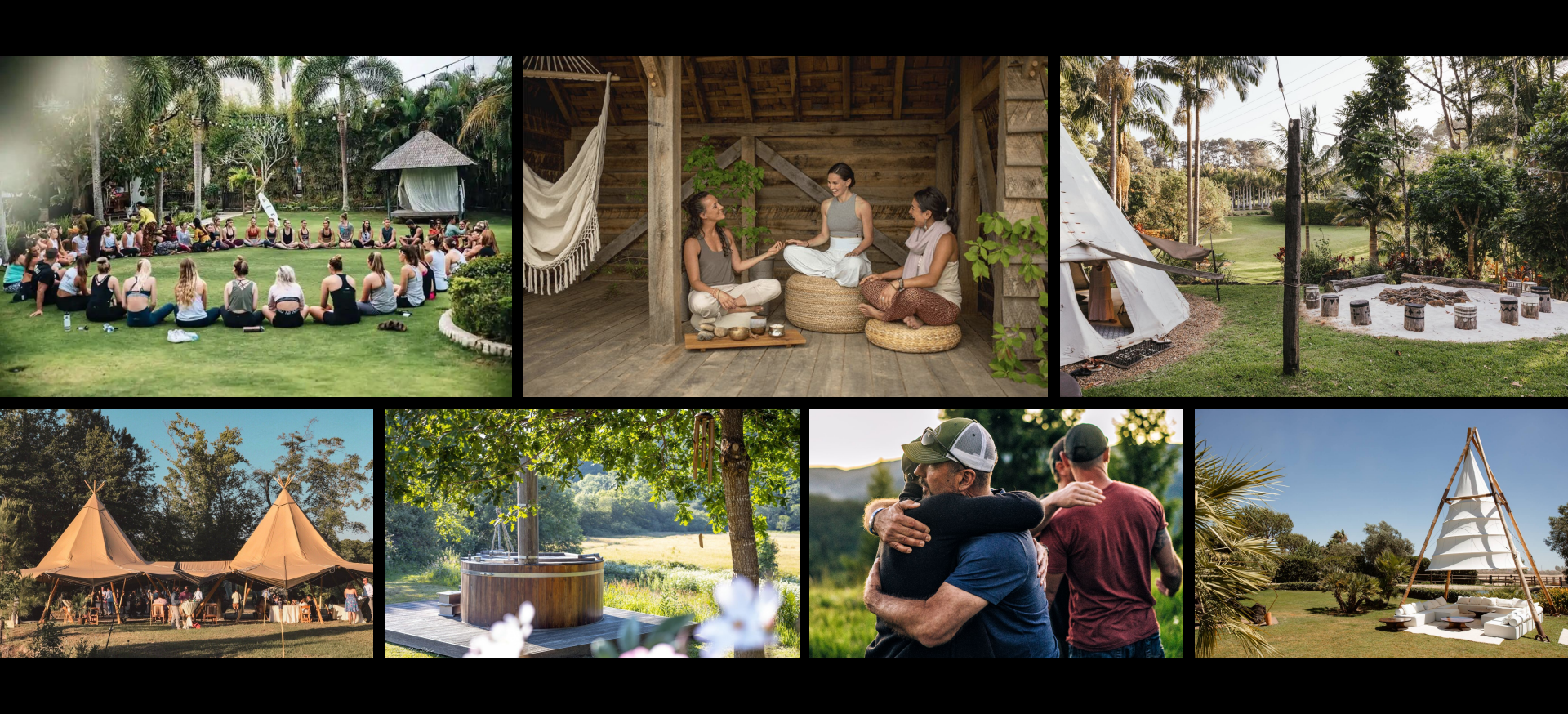
HUMANIDAD WELLNESS CENTER