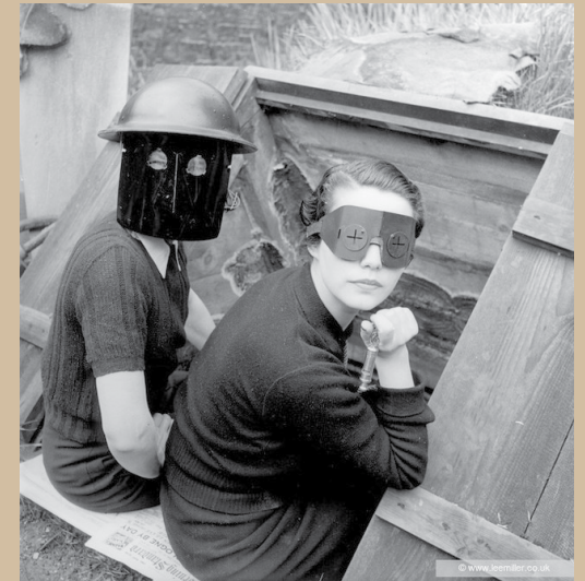
UK - VOGUE OFFICE - LOCATION