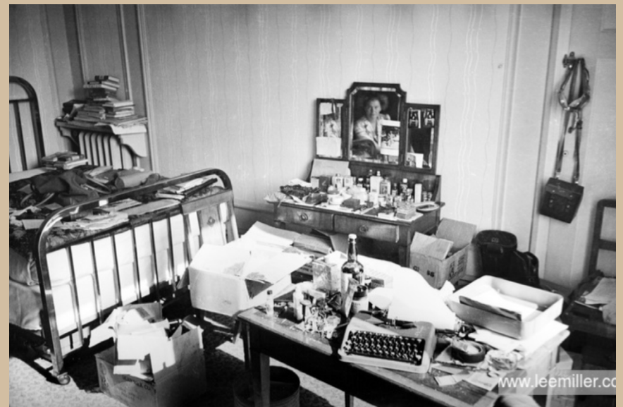
FRANCE - HOTEL SCRIBE - SET BUILD + LOCATION