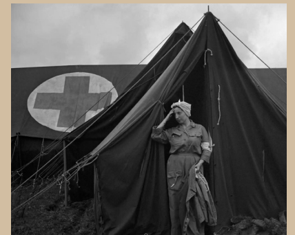
UK - ARMY HOSPITAL BASE - BUILT ON LOCATION