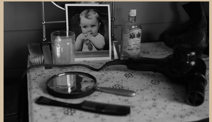
UK - WEST WALTHAM WOMEN'S HUTS - SET BUILD