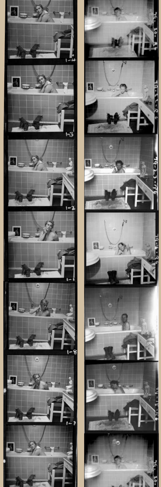
GERMANY - HITLER'S APARTMENT - SET BUILD & LOCATION