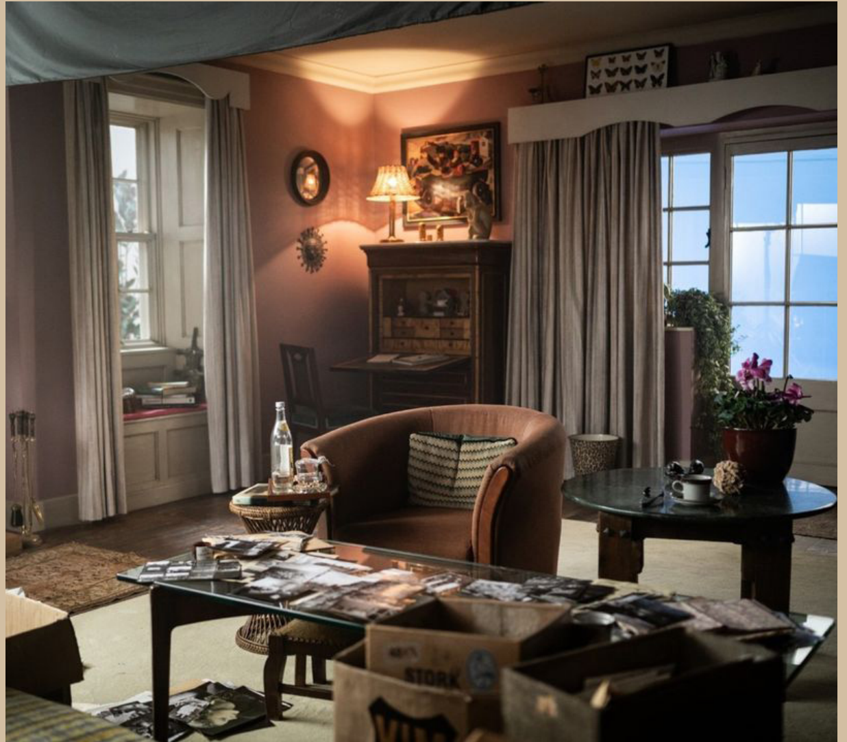
UK - FARLEY HOUSE - SET BUILD