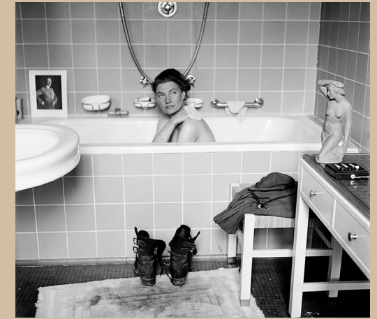
GERMANY - HITLER'S APARTMENT - SET BUILD & LOCATION