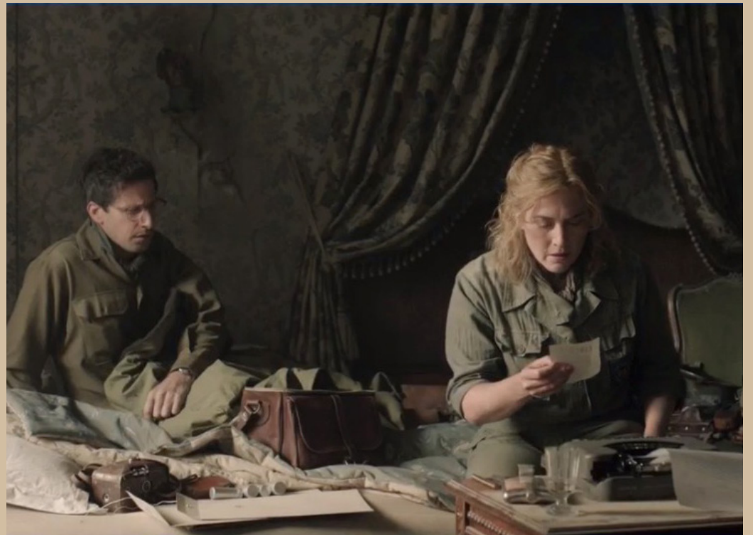
FRANCE - THE HONEYMOON SUITE - SET BUILD