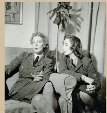
UK - DOWNSHIRE HOUSE - SET BUILD