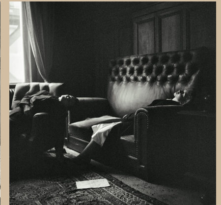
GERMANY - LEIPZIG TOWN HALL - LOCATION