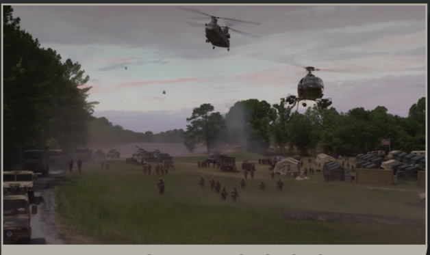
EXT WESTERN FORCES CAMP