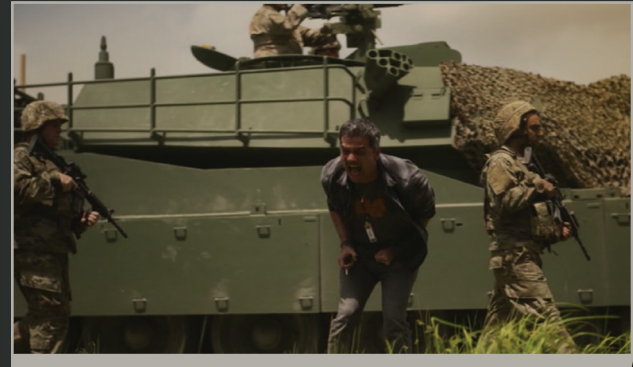
EXT WESTERN FORCES CAMP