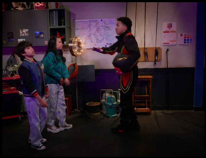
EP 108 Wilson Hall Auditorium