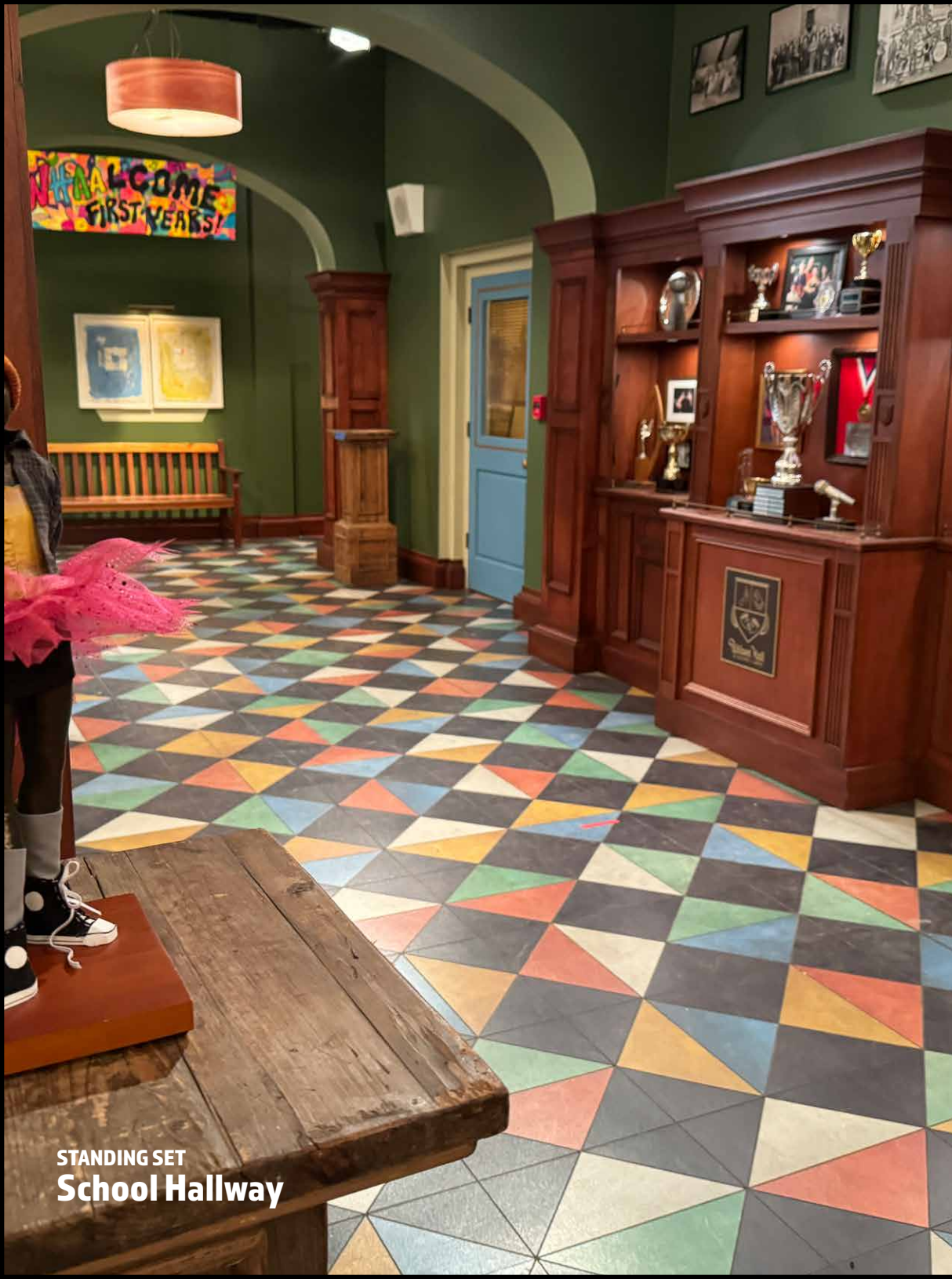
STANDING SET School Hallway