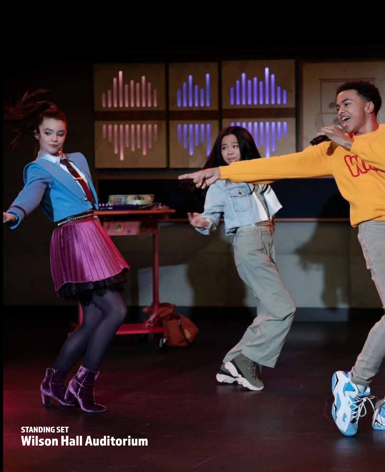
STANDING SET Wilson Hall Auditorium