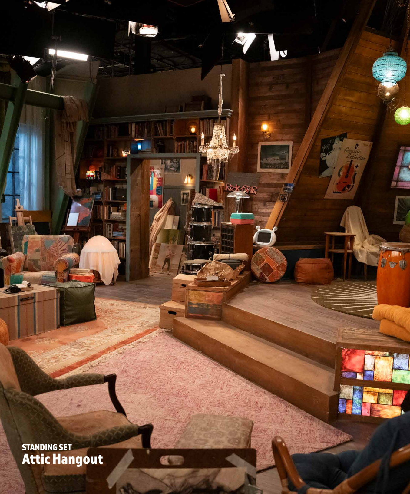
STANDING SET Attic Hangout