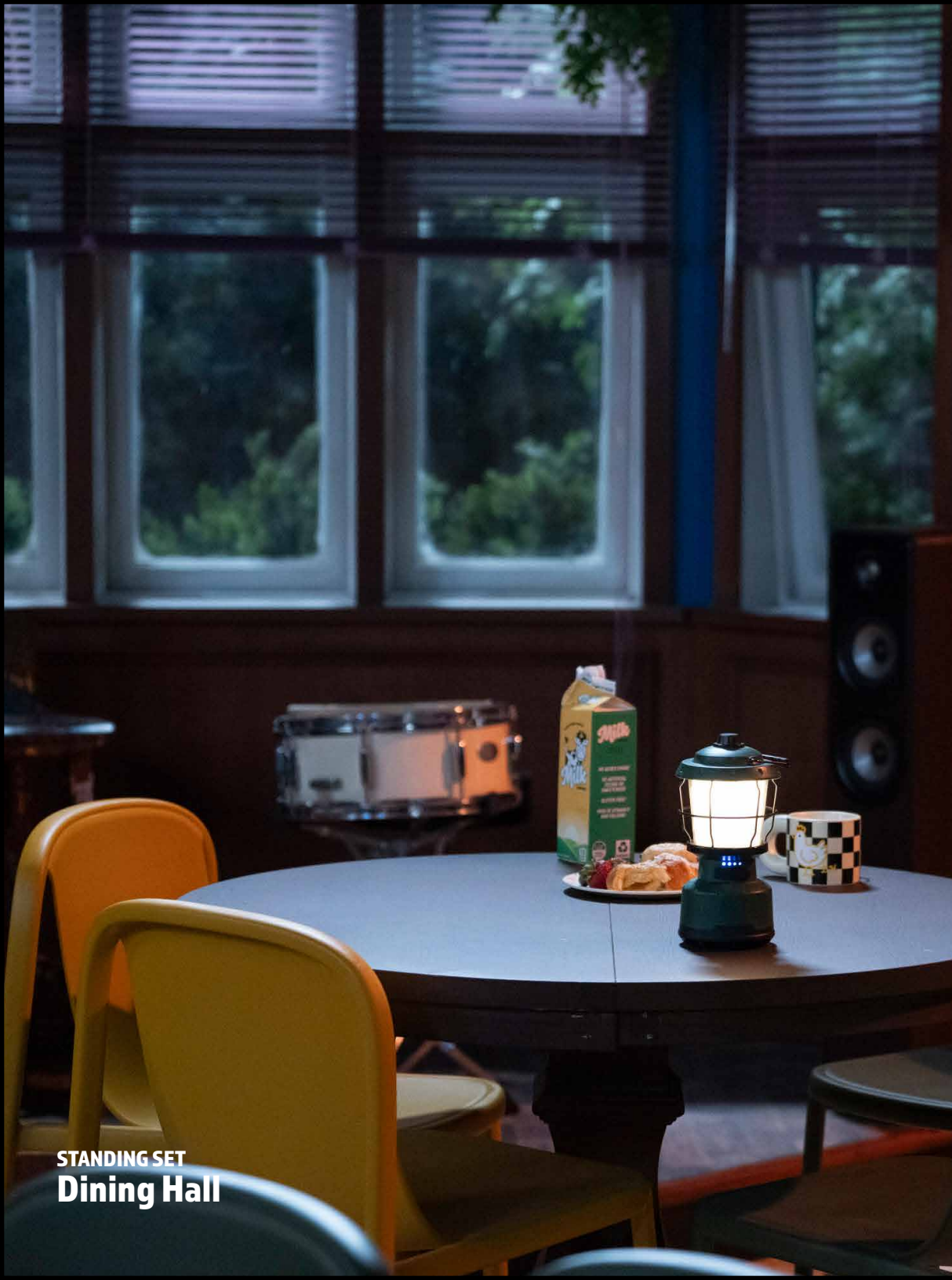
STANDING SET Dining Hall