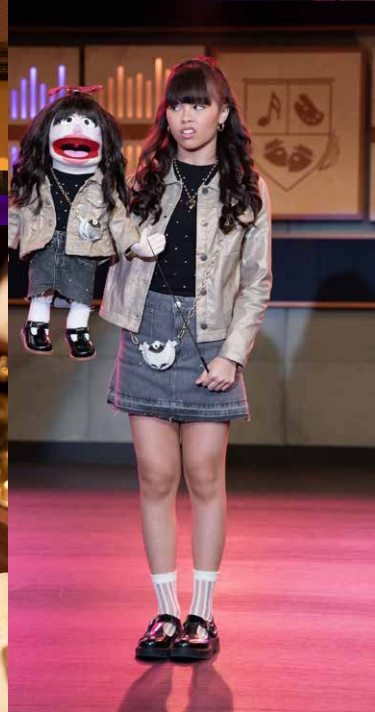
SEASON ONE Some of Our Favorite Details