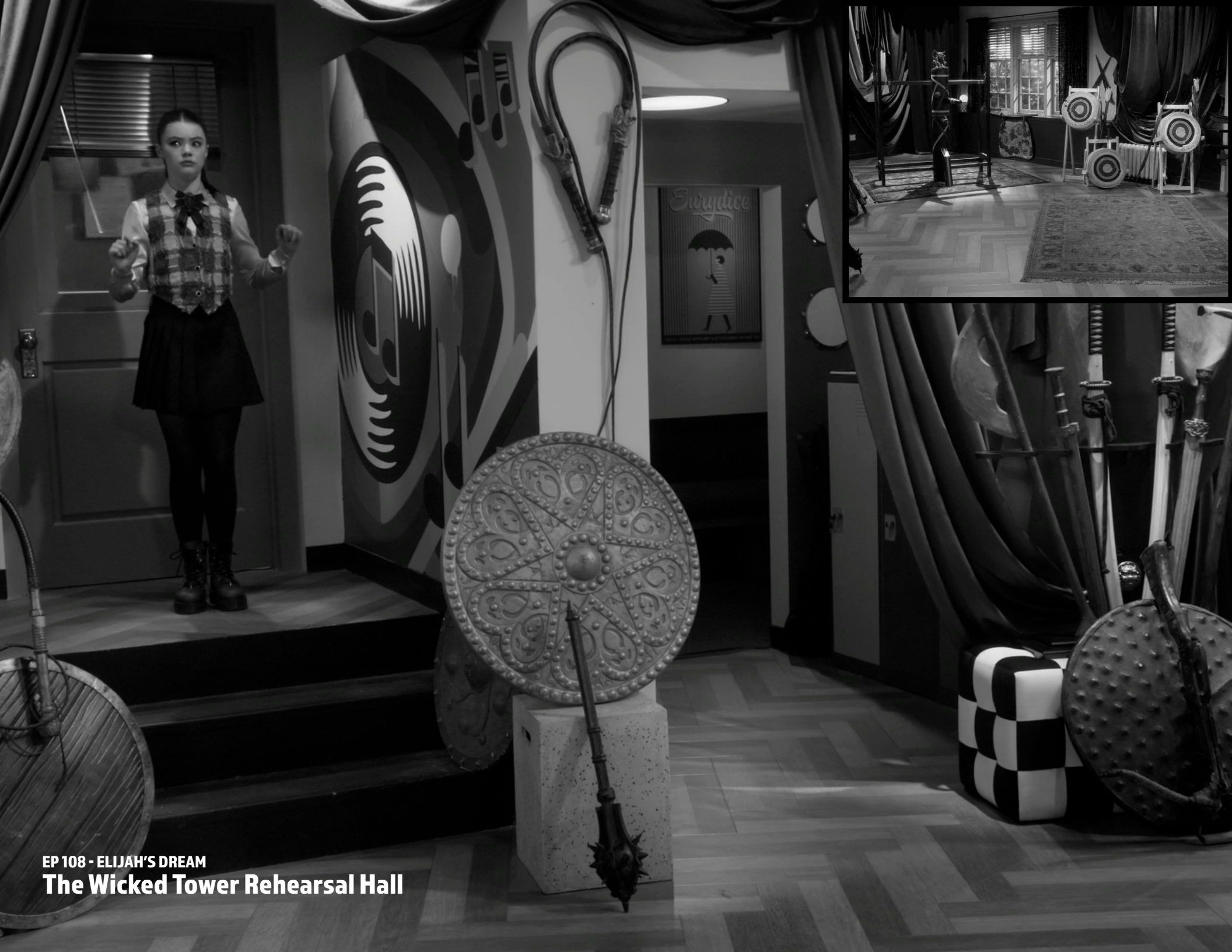
EP 108 - ELIJAH'S DREAM The Wicked Tower Rehearsal Hall