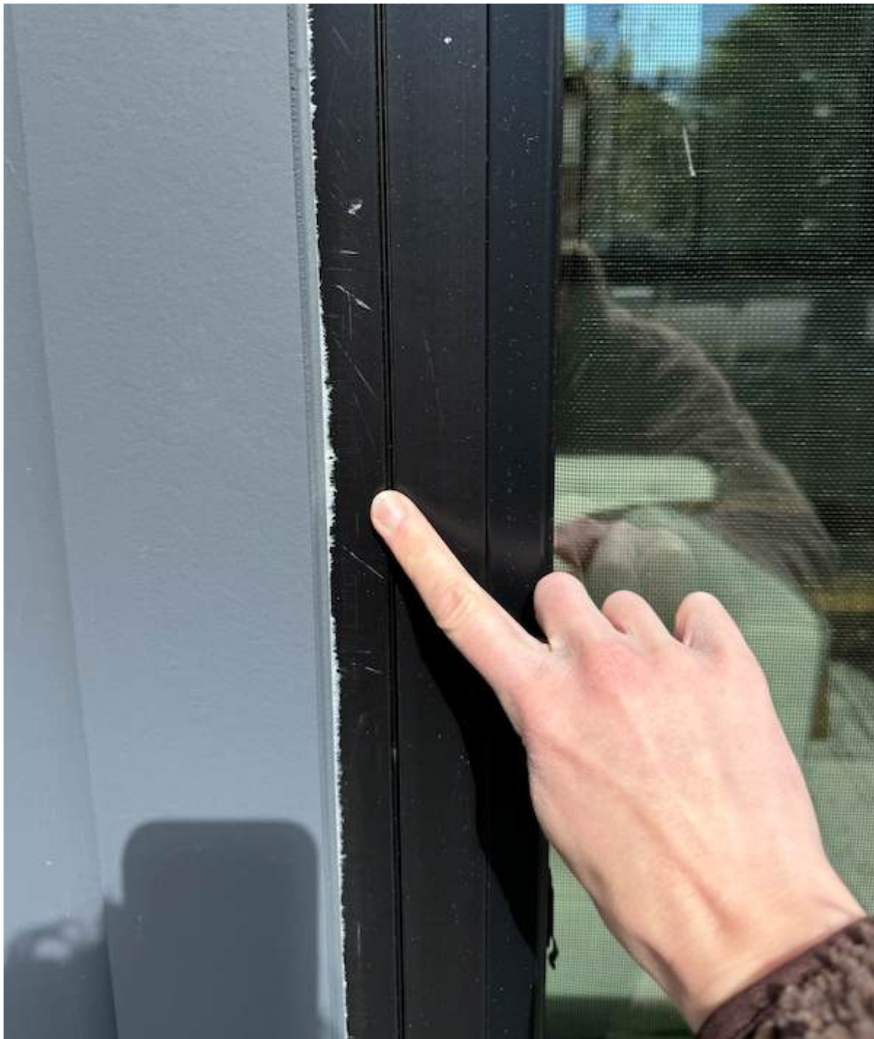
I'm sure the producer loved getting these photos from me via text... Not like it's a spot about windows or anything!