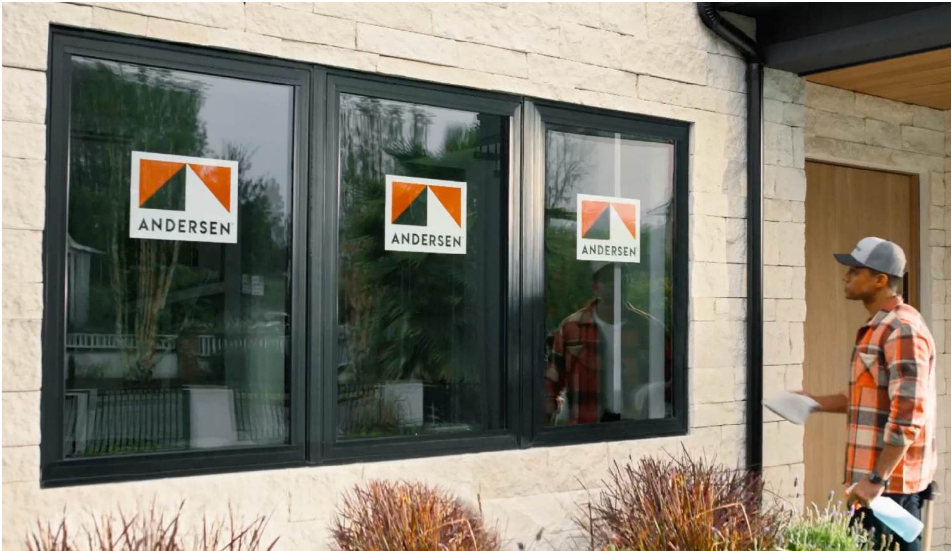
Post Art Department intervention.